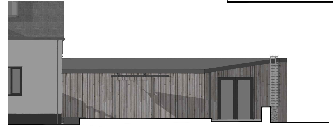
NORTH WESTERN ELEVATION