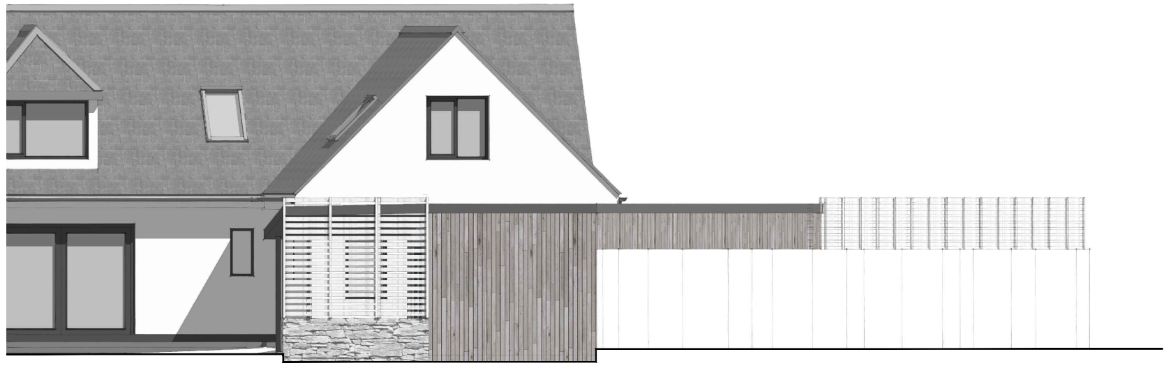
SOUTH WESTERN ELEVATION