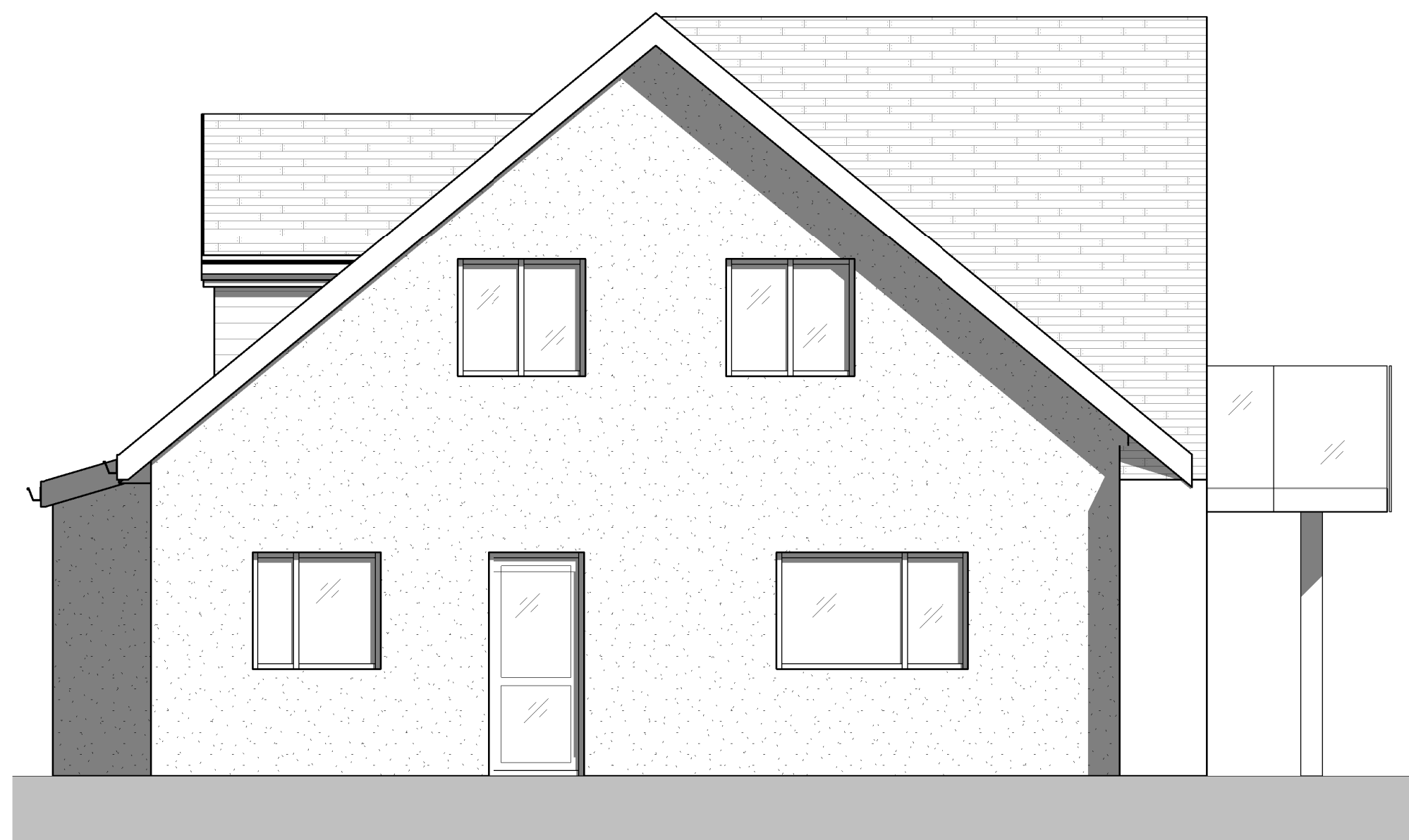
Existing Left Elevation 1:50