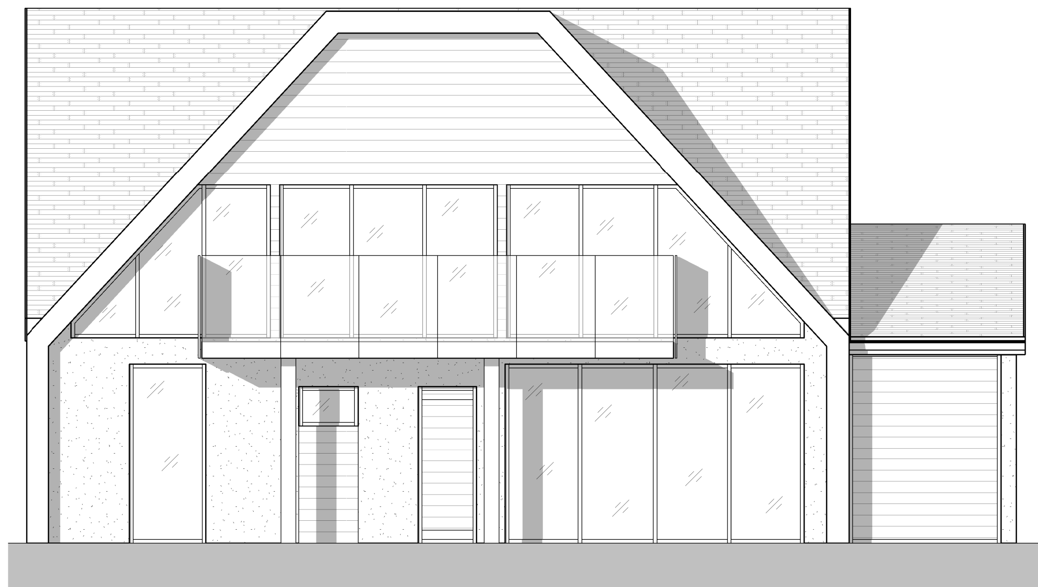
Existing Front Elevation 1:50