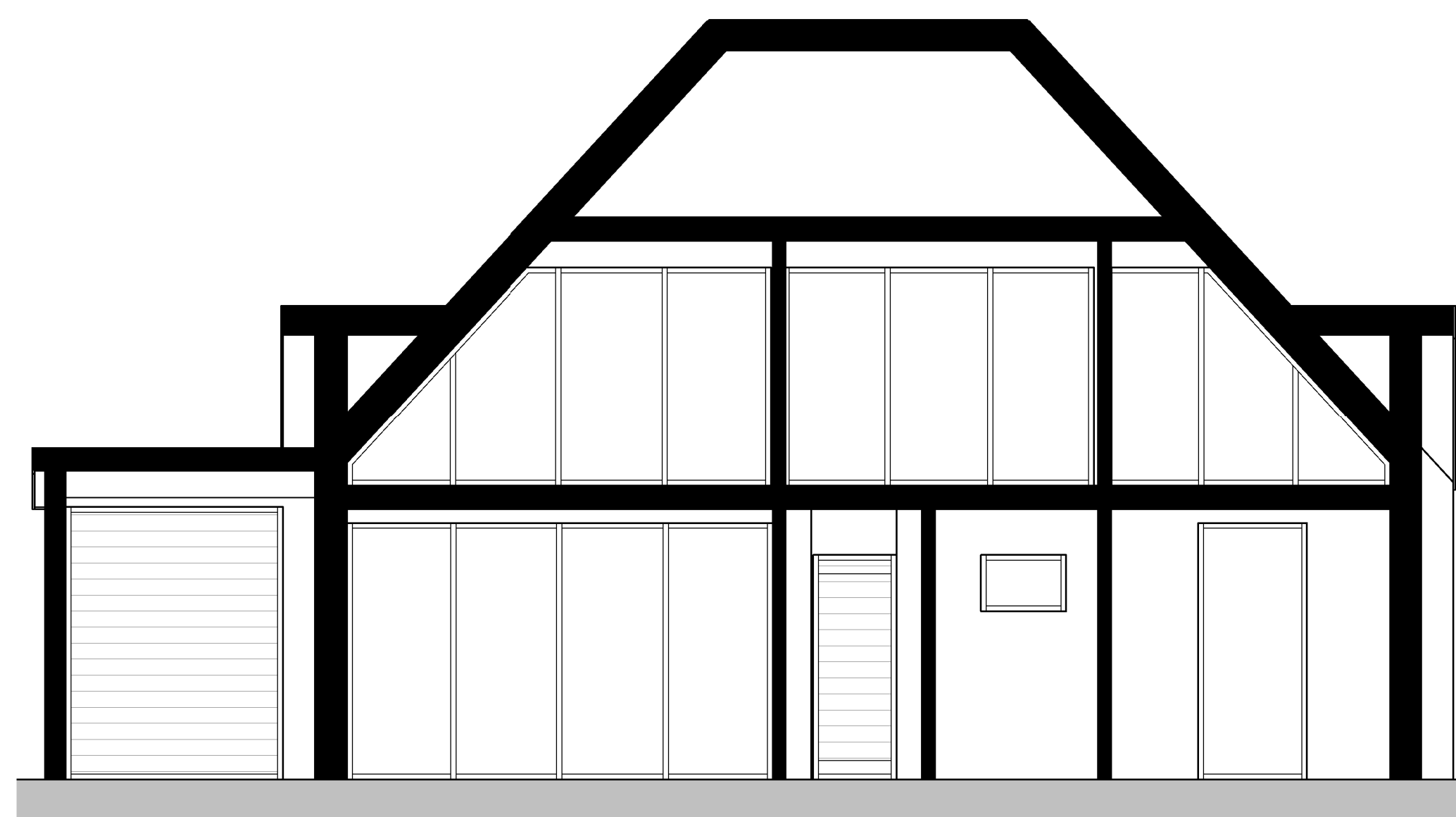
Existing Generic Section 1:50