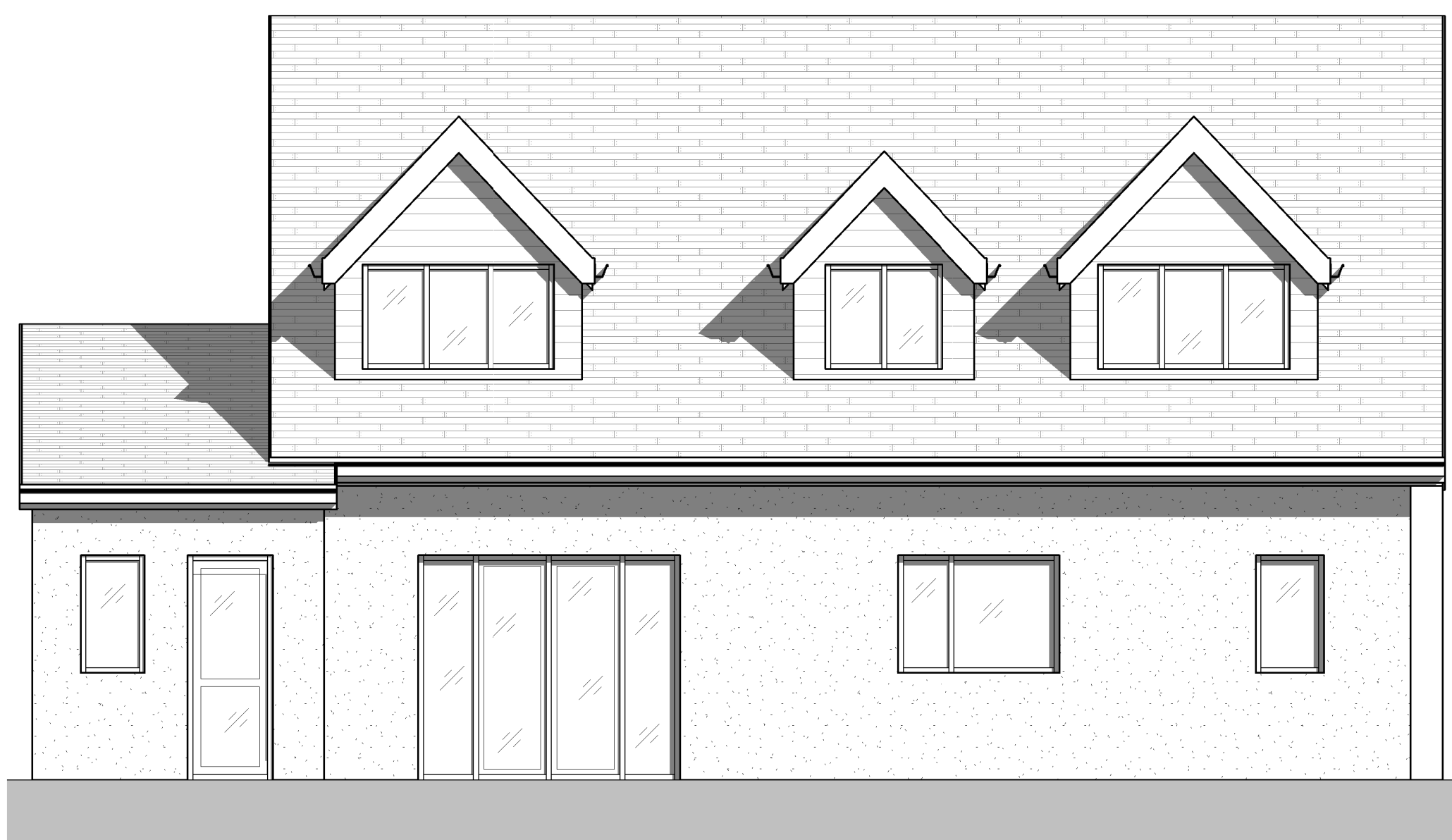
Existing Rear Elevation 1:50