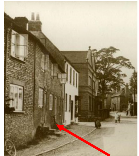
Historical image showing Midi-cote in the 1800's

The site is within the Bishop Waltham conservation Area. Bank End, Midi Cote and Croit Anna, formerly listed as Croit Anna & Bank End, was previously five cottages adjoining White Hart Cottages on the east. The now 3 properties are all Grade 2 listed buildings.