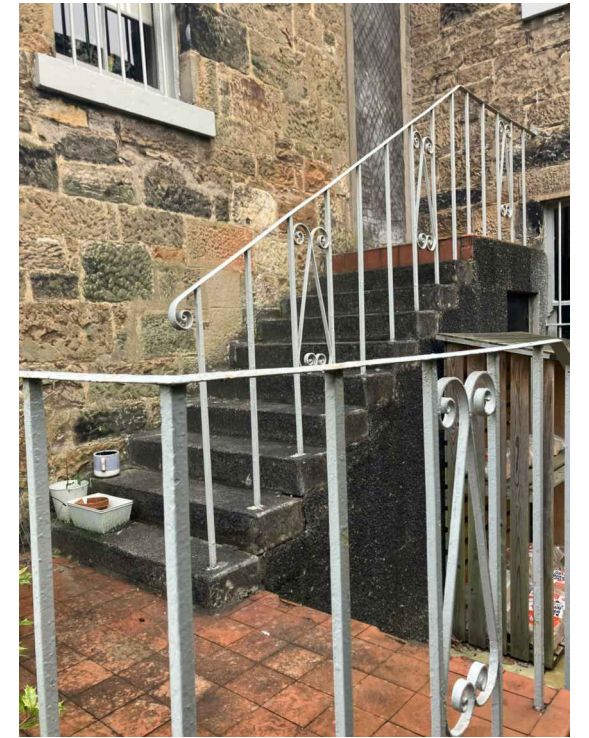
EXISTING EXTERNAL PHOTOGRAPHS