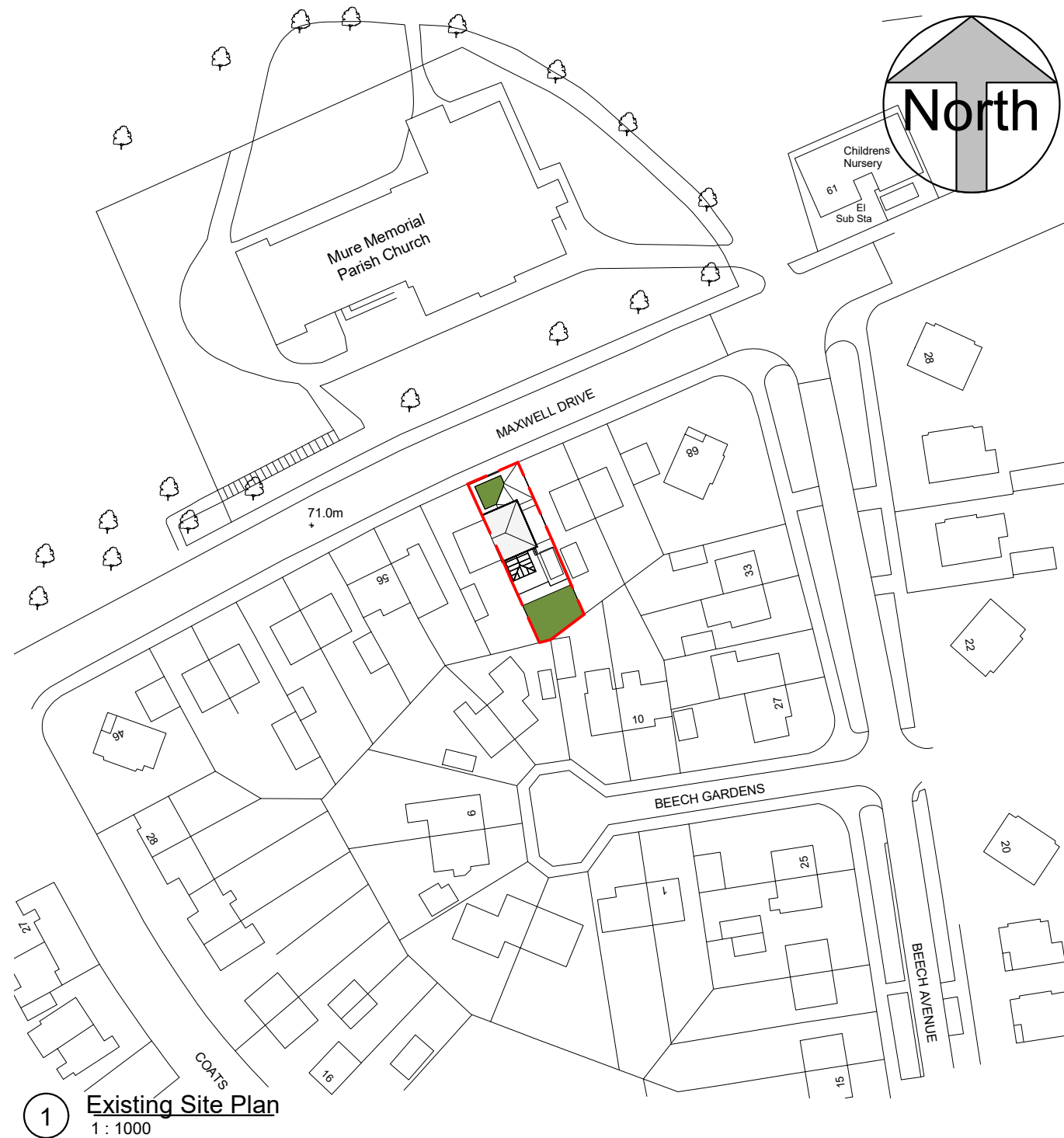
1 Existing Site Plan 1 : 1000

Foundations & Concrete floors - Structural engineer to inspect the foundations before pouring and after to confirm bearing capacity. Any variation to the foundation depth or formation suspected of having soft spots must immediately be reported to the engineer for recommendations.