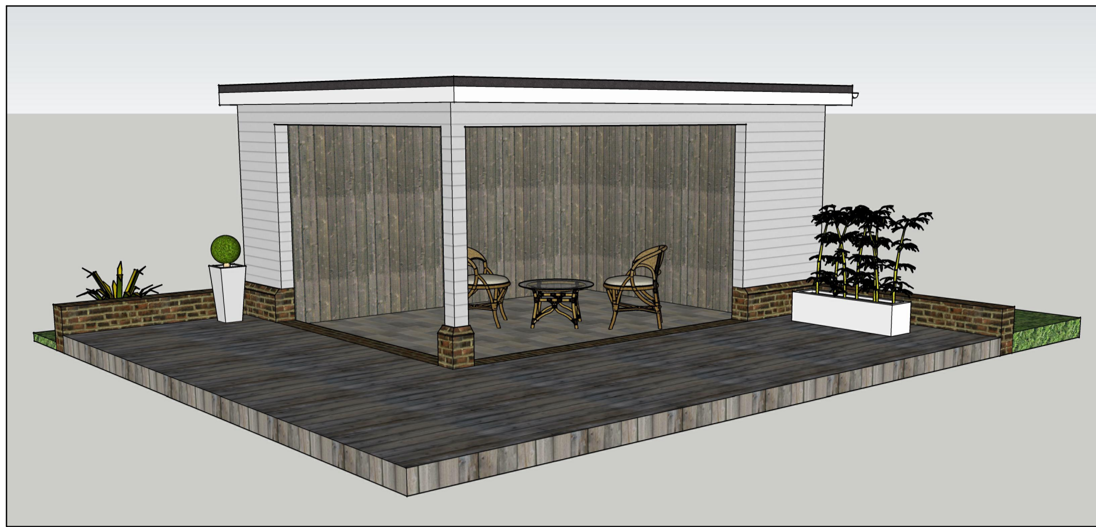
Perspective View 1