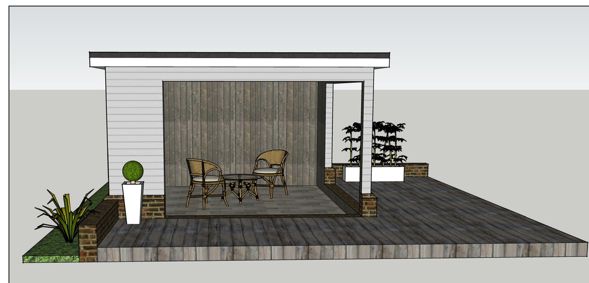
Perspective View 4