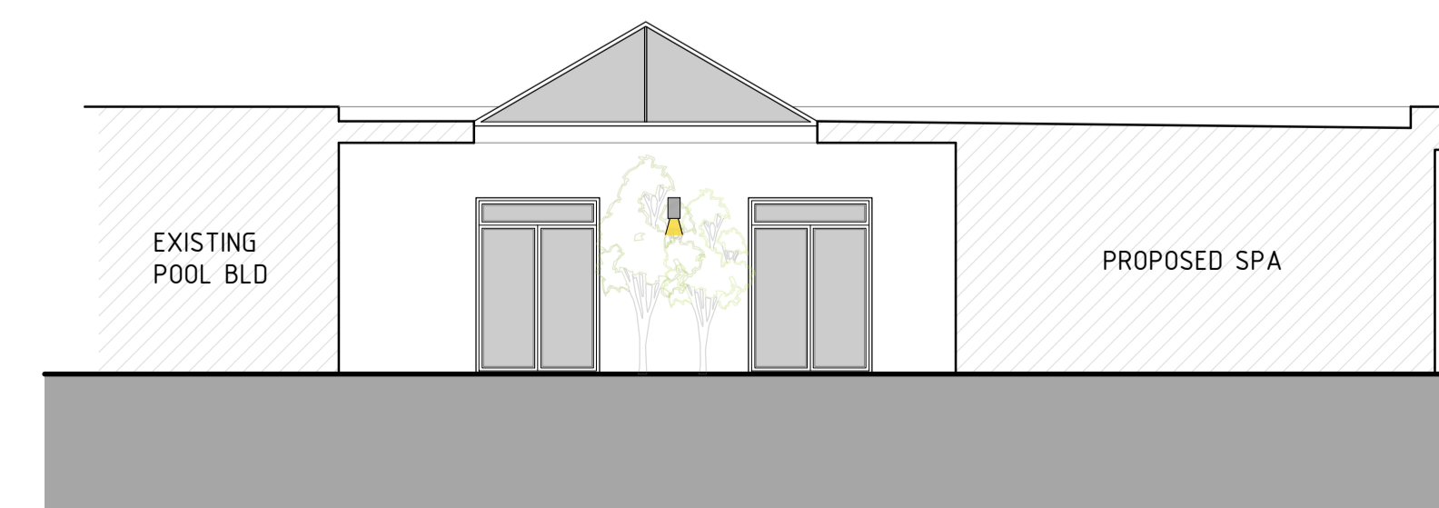
PROPOSED EAST FACING SPA COURTYARD ELEVATION SCALE 1:200 @ A1