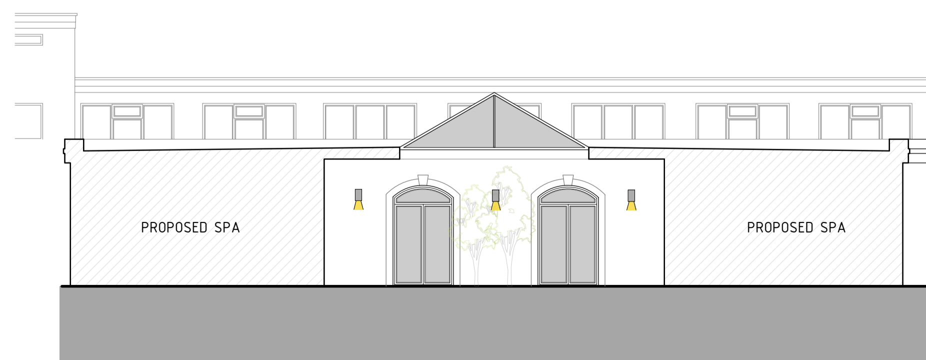
PROPOSED NORTH FACING SPA COURTYARD ELEVATION SCALE 1:200 @ A1