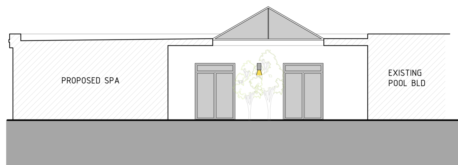
PROPOSED WEST FACING SPA COURTYARD ELEVATION SCALE 1:200 @ A1