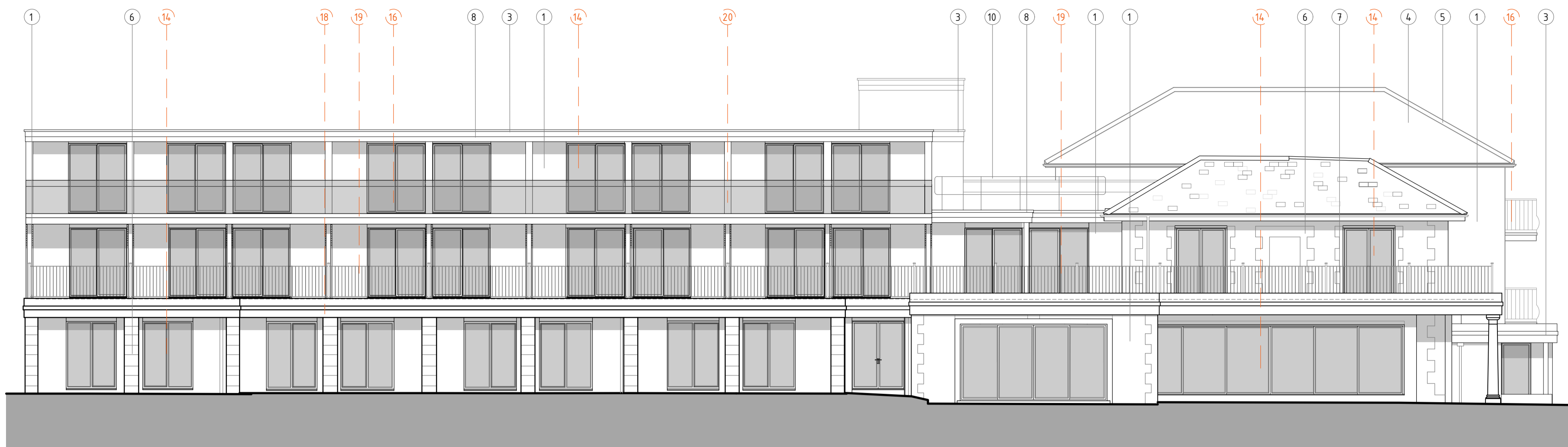
PROPOSED SOUTH ELEVATION - PROPOSED SPA BUILDING NOT VISIBLE ON ELEVATION SCALE 1:100 @ A1