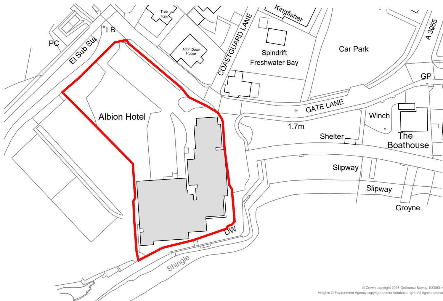
EXISTING SITE LOCATION PLAN SCALE 1:1250 @ A3