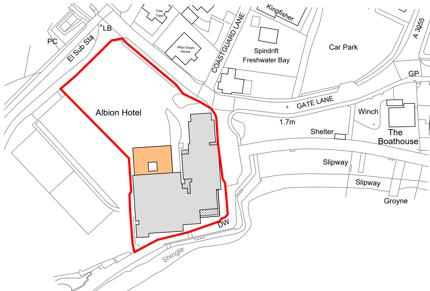
PROPOSED SITE LOCATION PLAN SCALE 1:1250 @ A3

NOTES: THIS DRAWING IS THE COPYRIGHT OF MODH DESIGN LTD. IT MAY NOT BE COPIED, ALTERED OR REPRODUCED WITHOUT WRITTEN AUTHORITY. THE USE OF THIS DRAWING BY THIRD PARTIES IS ENTIRELY AT THEIR OWN RISK. THE DRAWING MUST NOT BE SCALED. ALL LEVELS AND DIMENSIONS MUST BE CHECKED ON SITE. FIGURED DIMENSIONS MUST BE CHECKED ON SITE. FIGURED DIMENSIONS SHOULD BE TAKEN IN PREFERENCE TO SCALED DIMENSIONS.