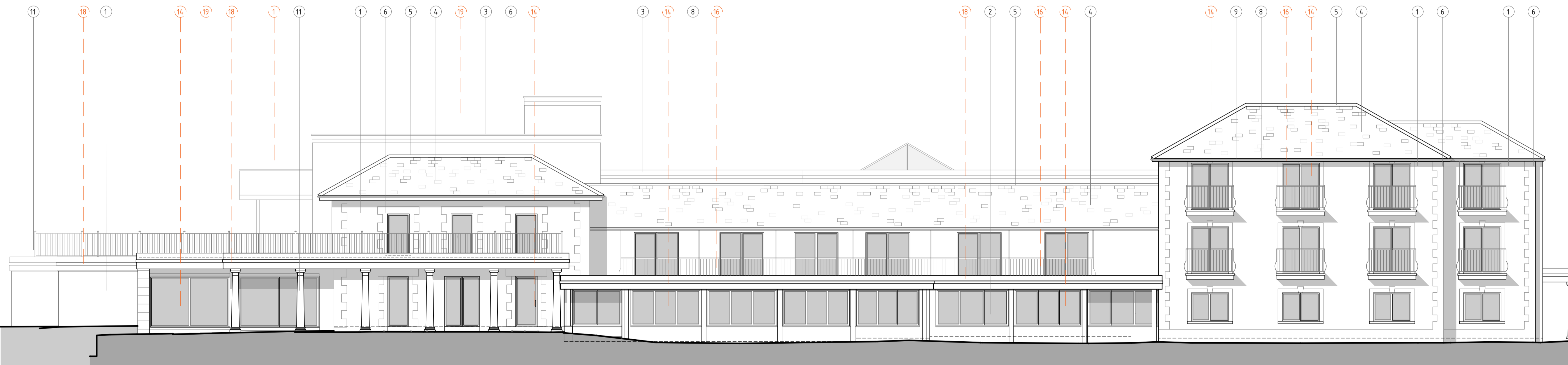
PROPOSED EAST ELEVATION SCALE 1:100 @ A1