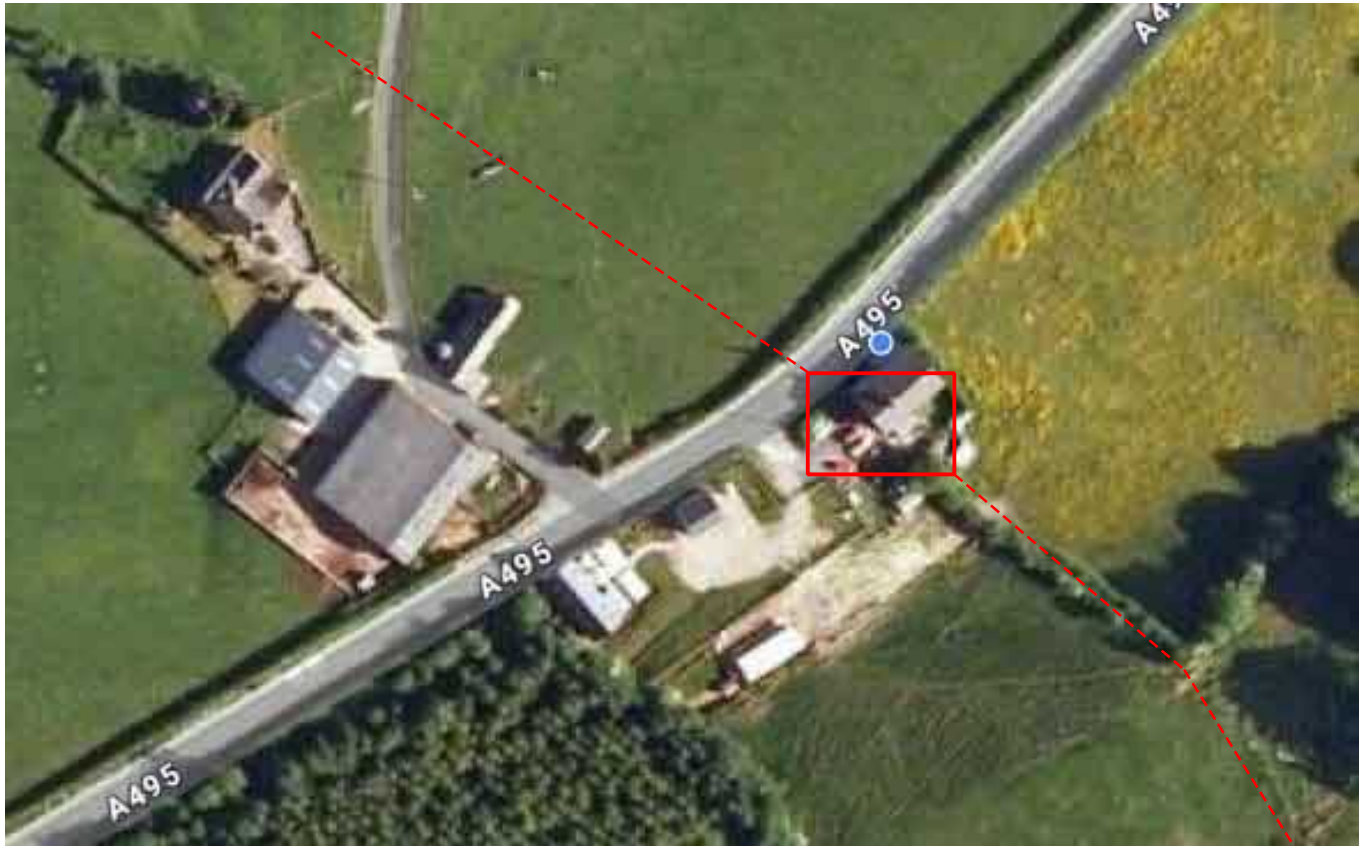
A_Bethlehem Chapel Rural location