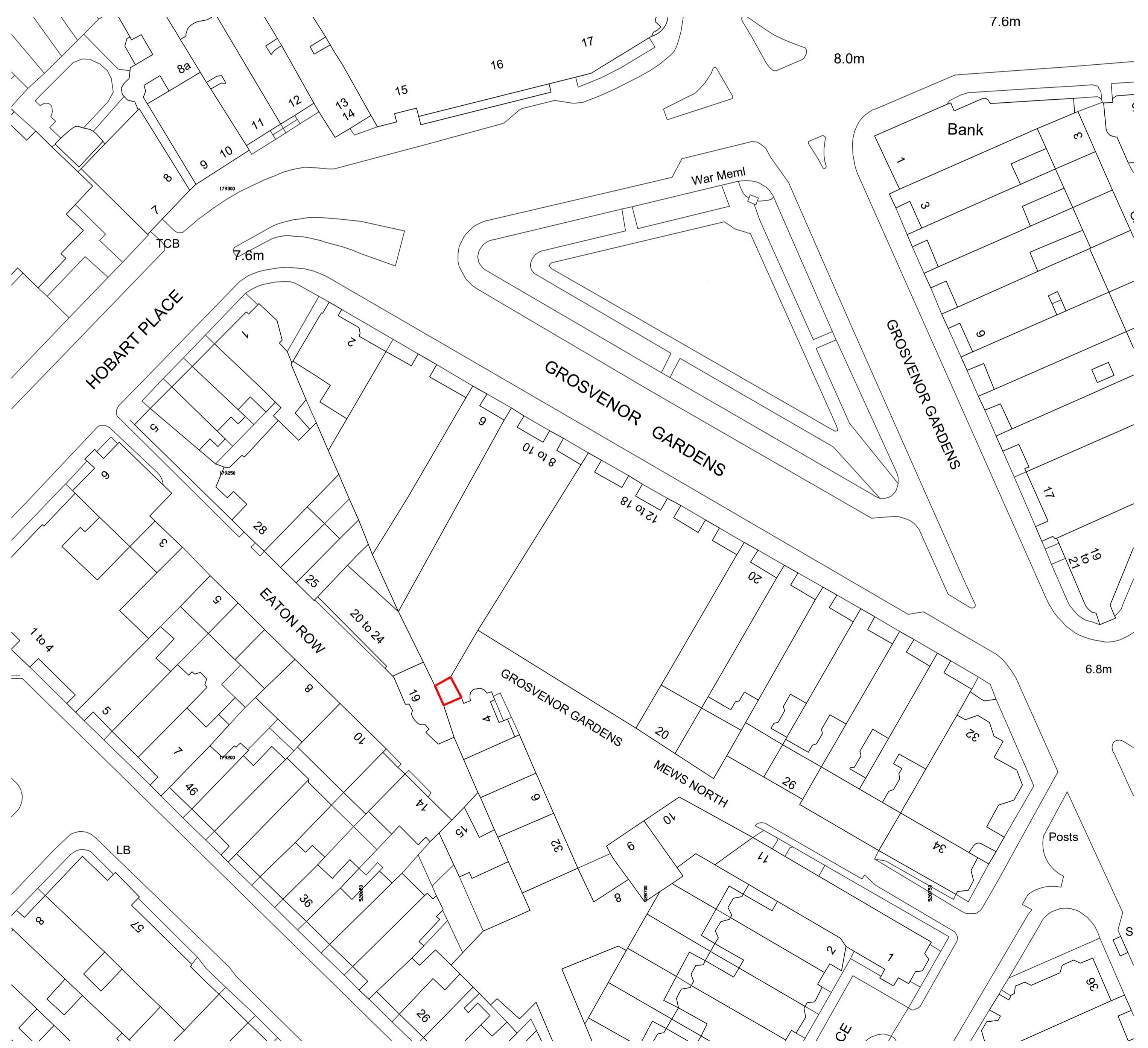
02 Site Location Plan 00.101 1:500@A1 1:1000@A3