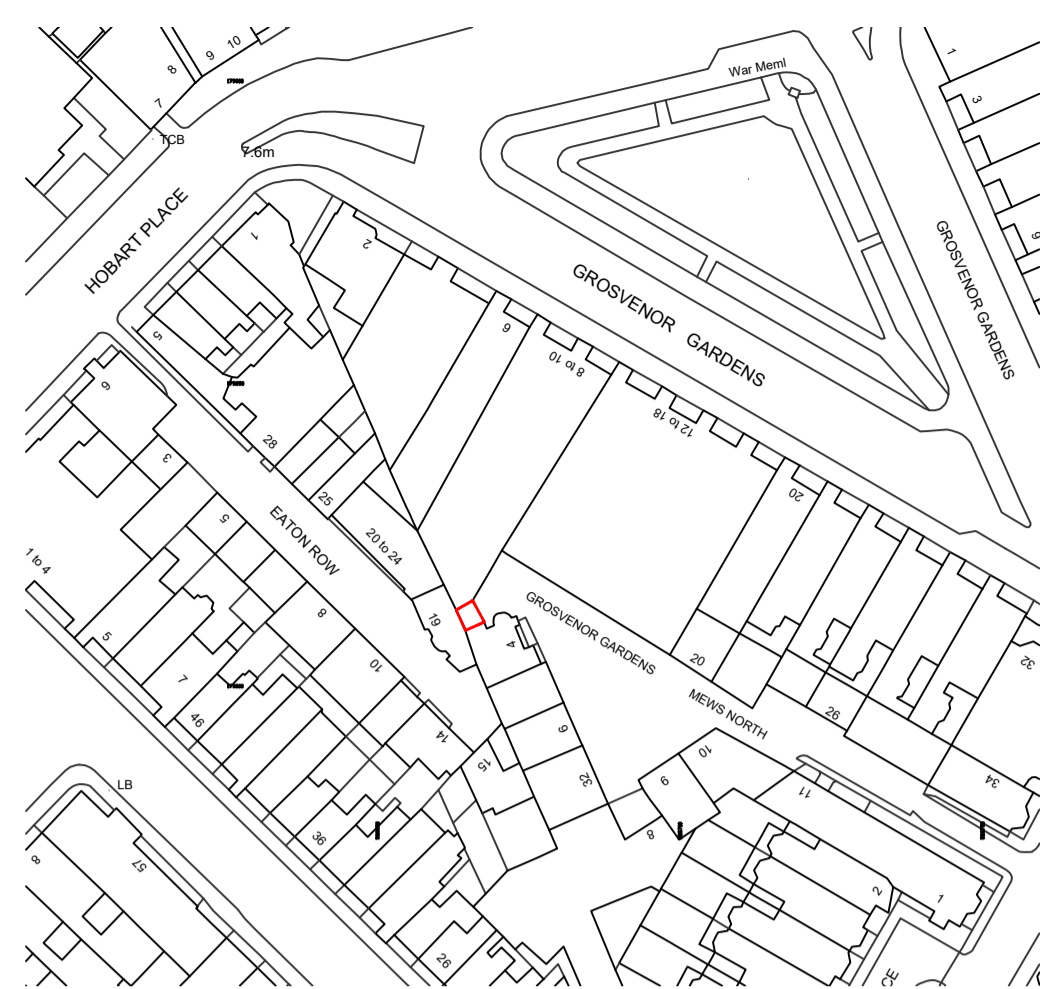
01 Site Location Plan 00.101 1:1250@A1