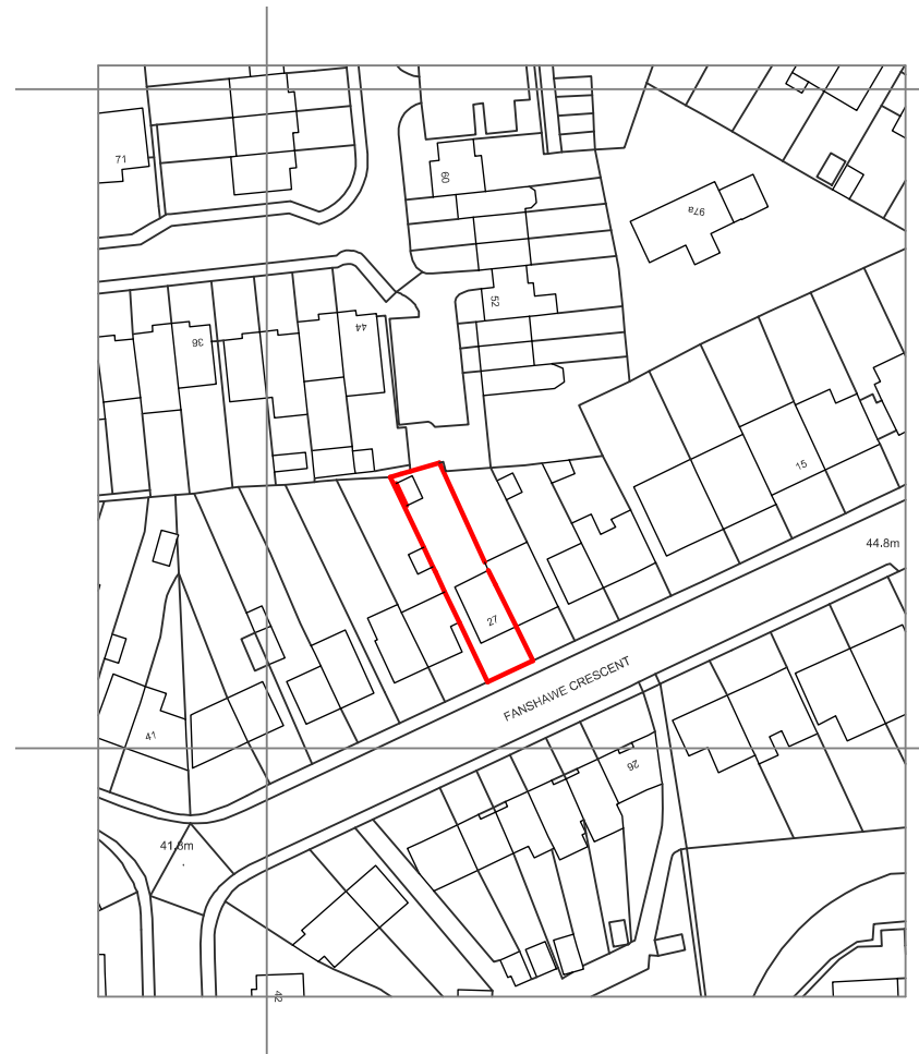
L O C A T I O N P L A N

Crown Copyright and database rights 2023 OS Licence no. AC0000849896