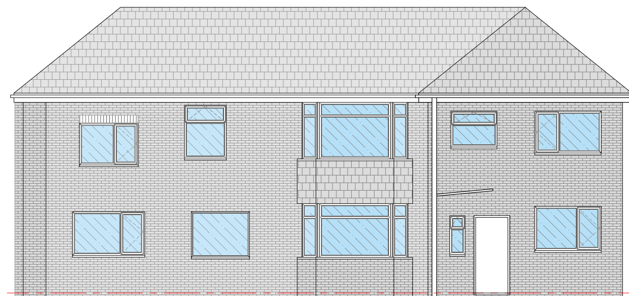
Existing Rear Elevation (Scale - 1:100)