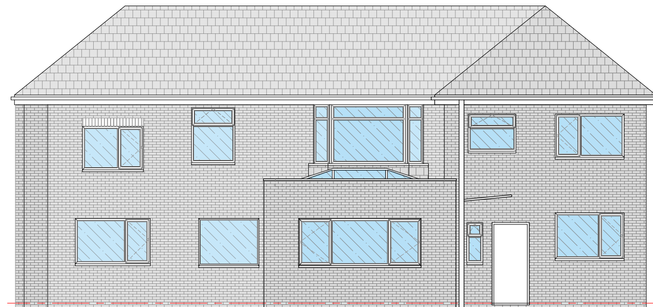
Proposed Rear Elevation (Scale - 1:100)