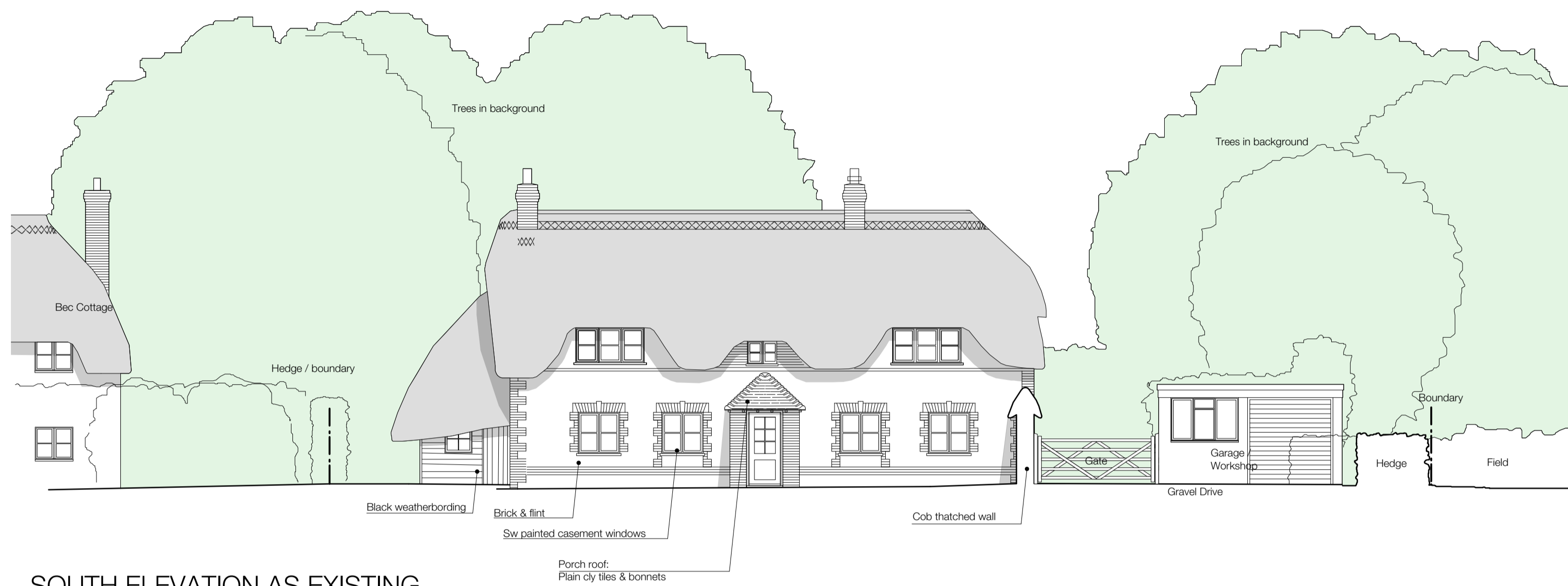
SOUTH ELEVATION AS EXISTING