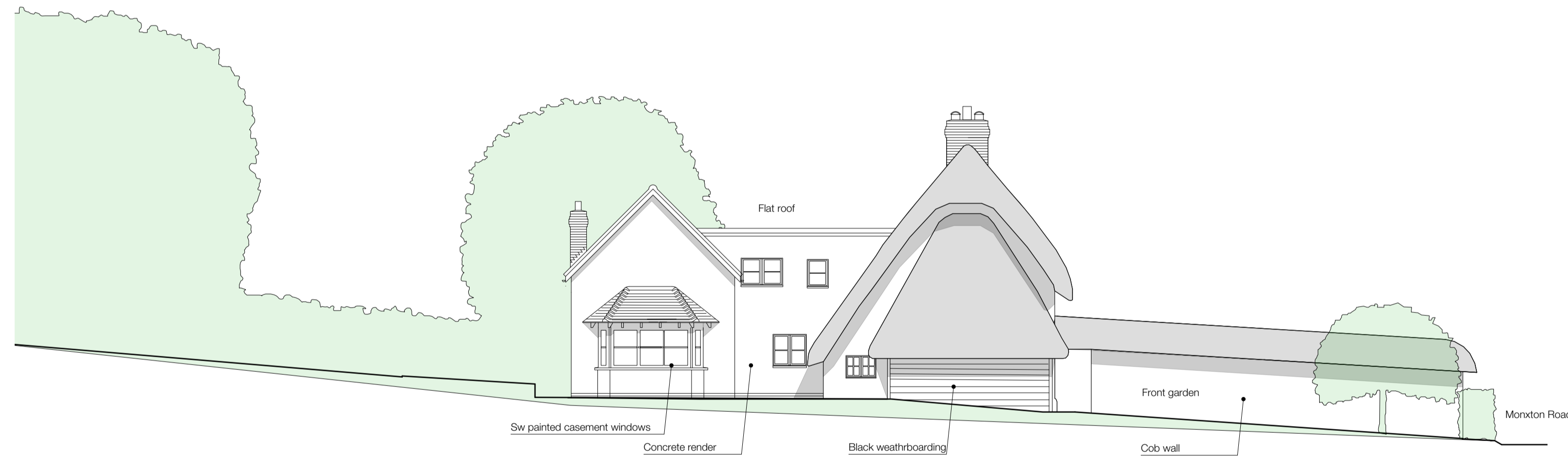
WEST ELEVATION AS EXISTING