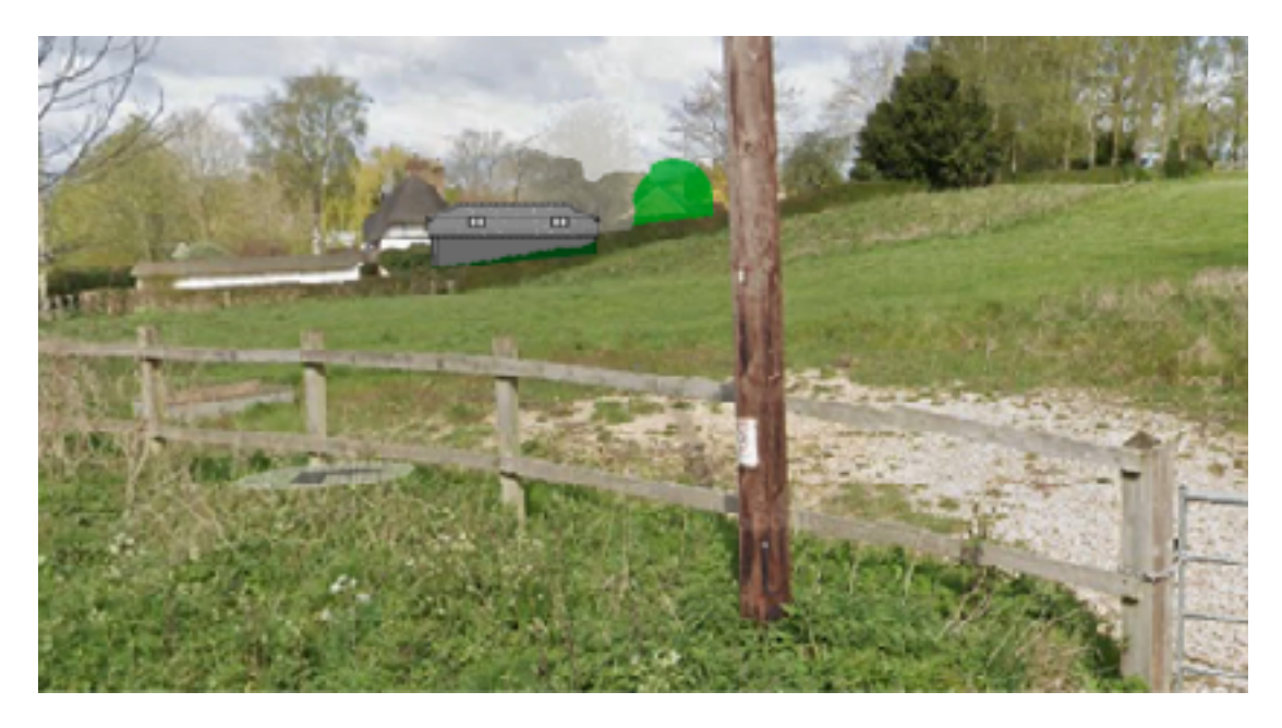
Fig. 4 View with proposed scheme illustrated and outline of replacement tree