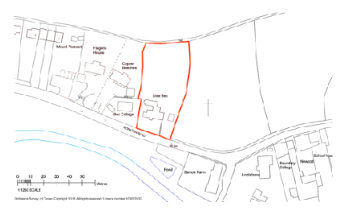
Fig. 2 Location Plan (see scale bar)

TVN.05830 04/01/1990 Alterations and two-storey extension | Little Bec Sarson Amport Approved