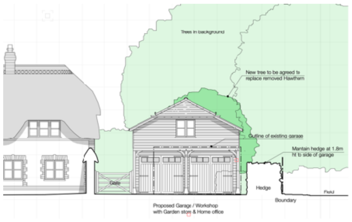
Fig. 5 South Elevation

When viewed from the east, the impact is altered from the white extension to the proposed slate roof and oak weatherboarding of the building. See Fig. 3 and Fig. 4. The proposed