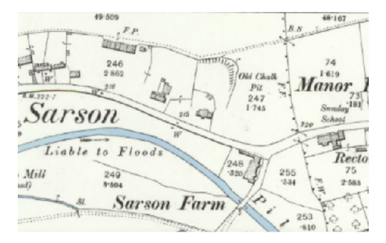
Fig. 1 Ordinance Survey 1:2500 Circa 1896

Little Bec cottage is located on the east side of Amport, on the north side of Monxton Road, and is the last property before Monxton village. Monxton Road runs through the village of Amport, roughly parallel to the Pillhill Brook, flowing approximately 40m to the south of the cottage. The cottage is located on rising ground approximately half a meter above road level and set behind a front garden. See Figure 1: Location Plan.