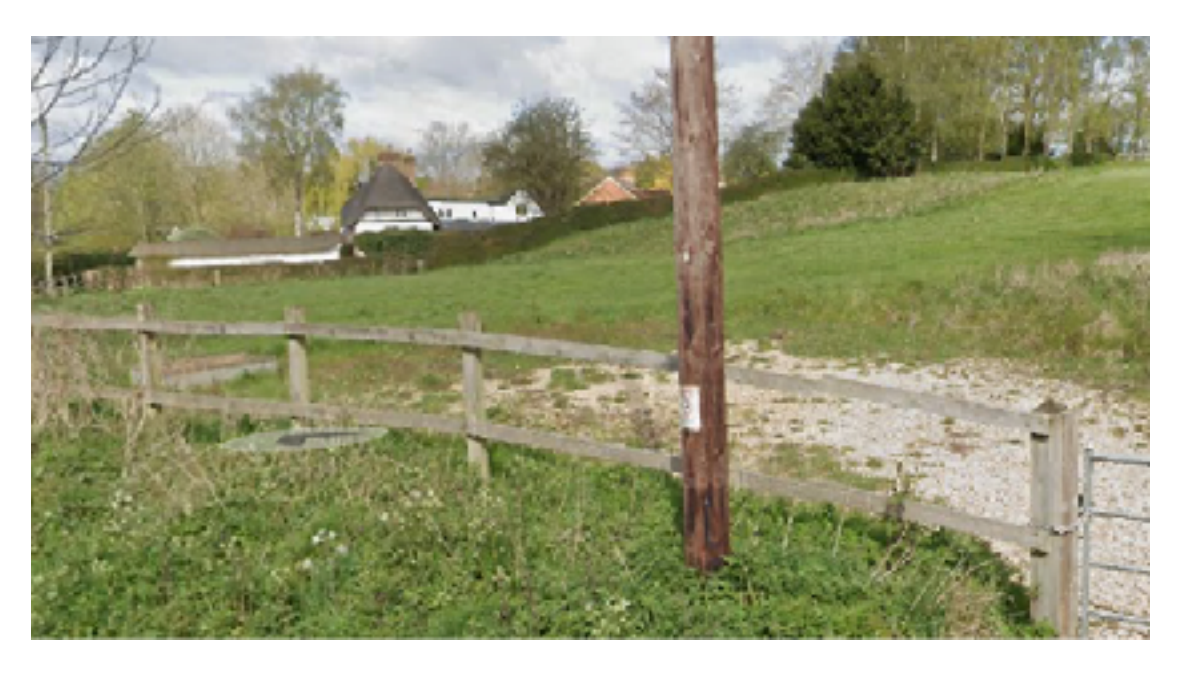
Fig. 3 Eastern Approach

The rear extension of the 1950s were seen as unsympathetic to the traditional thatched cottage with a boxy flat roof. The more recent planning history shows there have been some additions to this to improve the modern structure and soften its look. The more recent single-story rear/side entrance, approved in 2012, softened the boxy elevation. All these extensions combined are now an improvement, is well hidden from the front. At first floor level, the extension is connected by the 1950s linked flat roof to the 1990 extension, 1.5-story, roof with gabled ends. The extension north elevation has a more traditional/contemporary look with rendered walls under a plain tiled roof, which is subordinate in height to the existing thatched cottage. The east elevation can be seen from the east on Monxton Road. See fig 3.