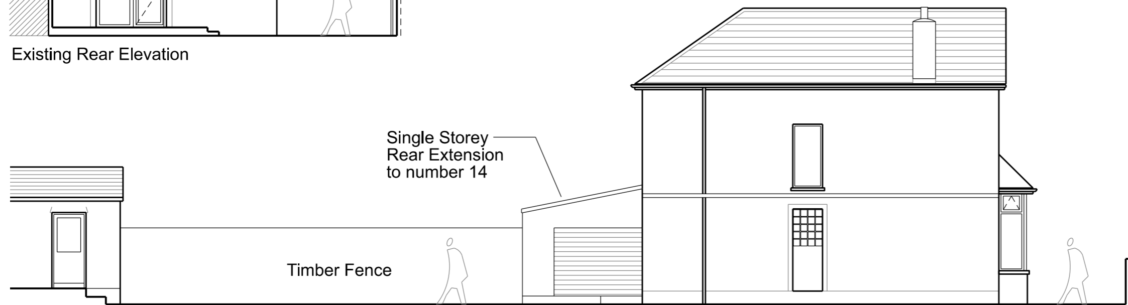
Existing Side Elevation (North) - House and Front Garden