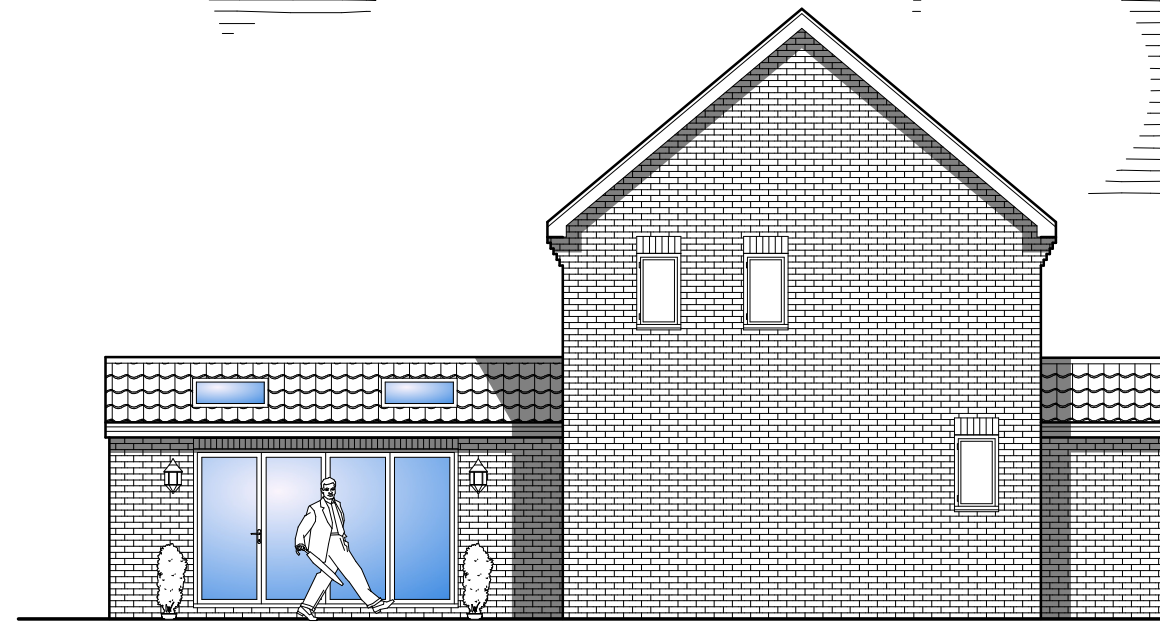
Side Elevation as Proposed.