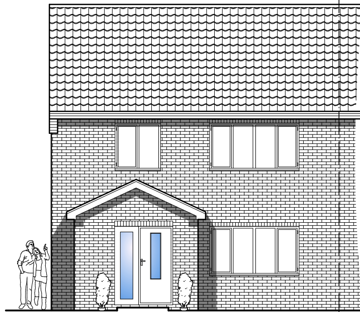
Front Elevation as Proposed.

DRAWING PREPARED BY: MARK GARFITT, ARCHITECTURAL TECHNOLOGIST. Tel: 07789 996636 Email: mark@mgarchitecturaldesigns.co.uk