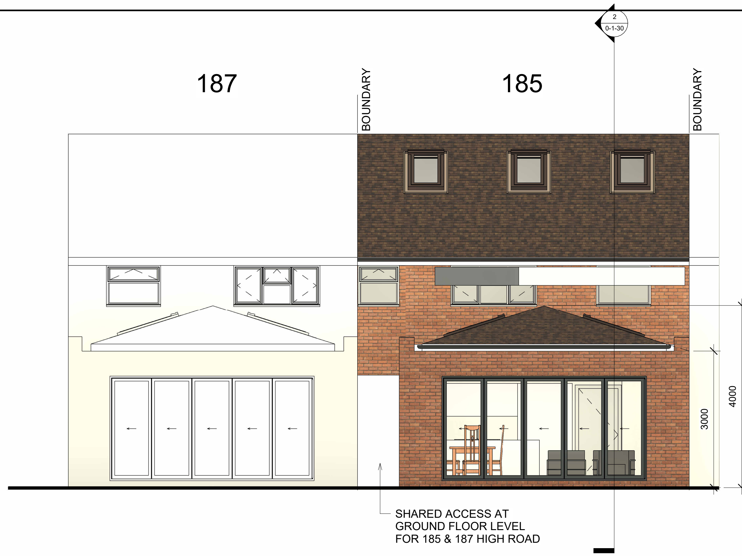
2 Rear Elevation - Proposed 1 : 50