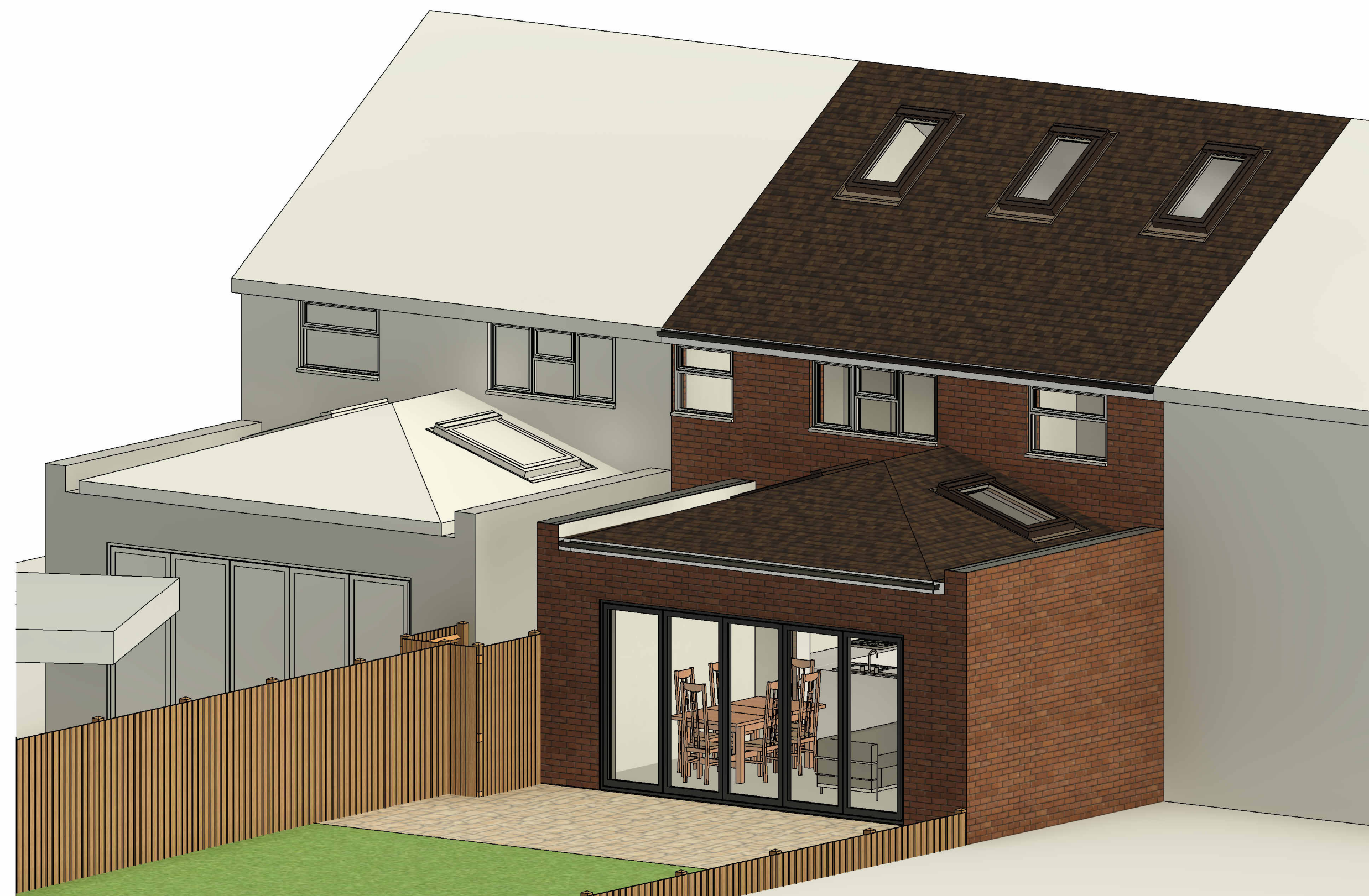
4 3D View - Proposed