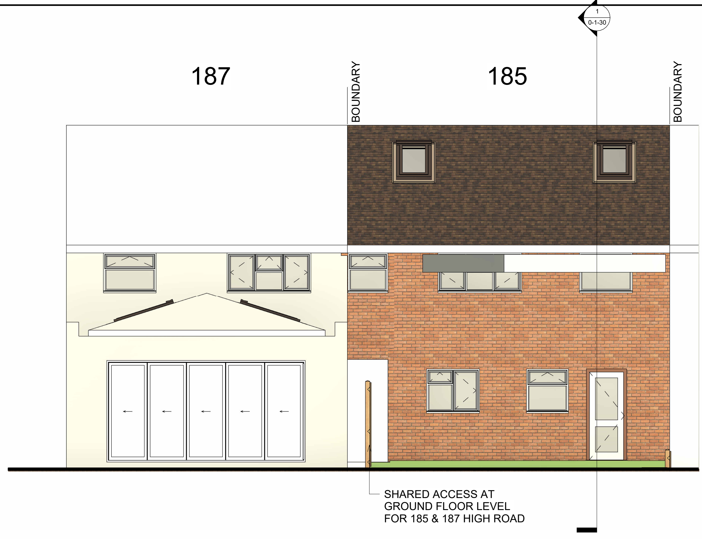
2 Rear Elevation - Existing 1 : 50