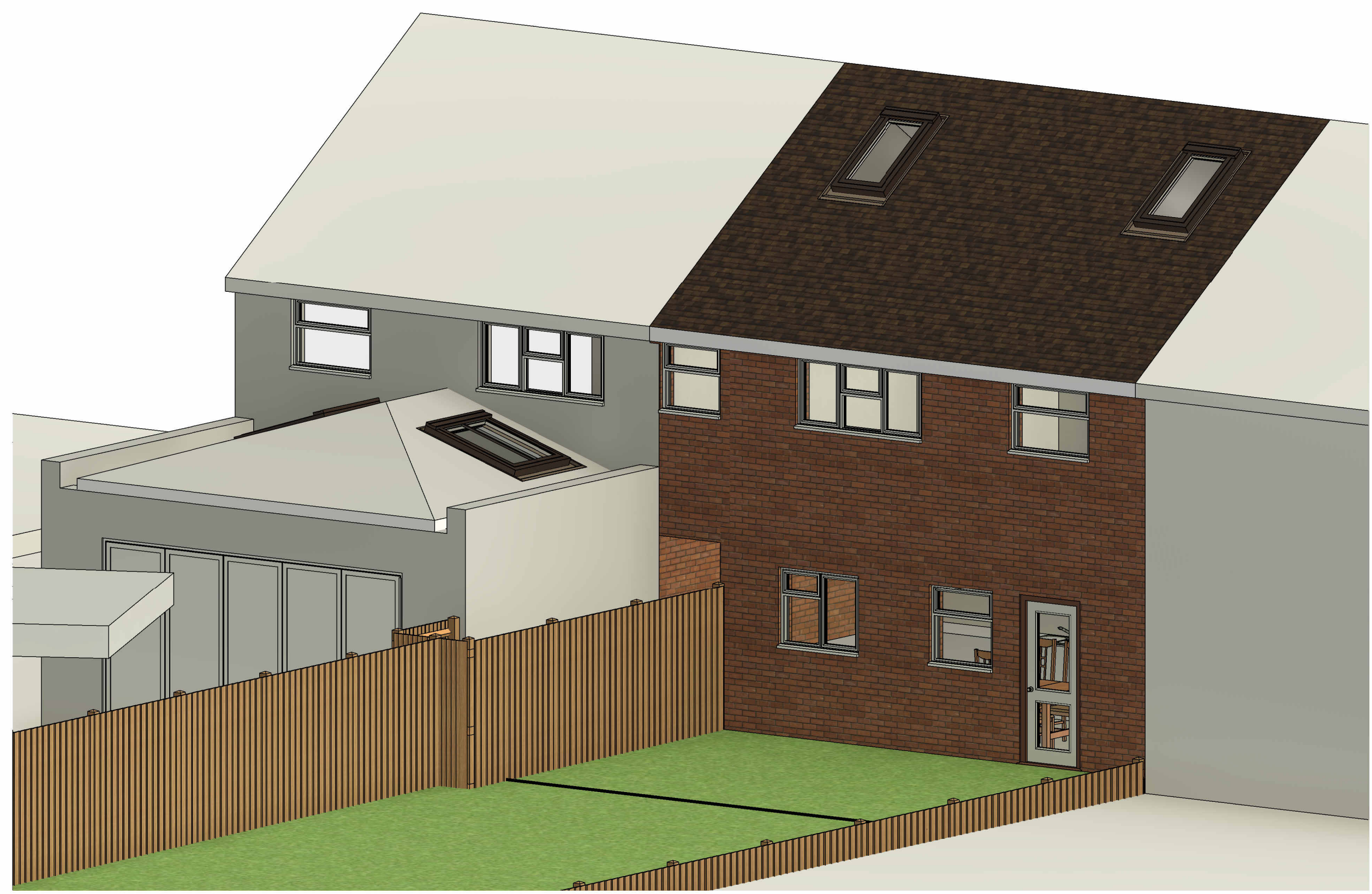
4 3D View - Existing