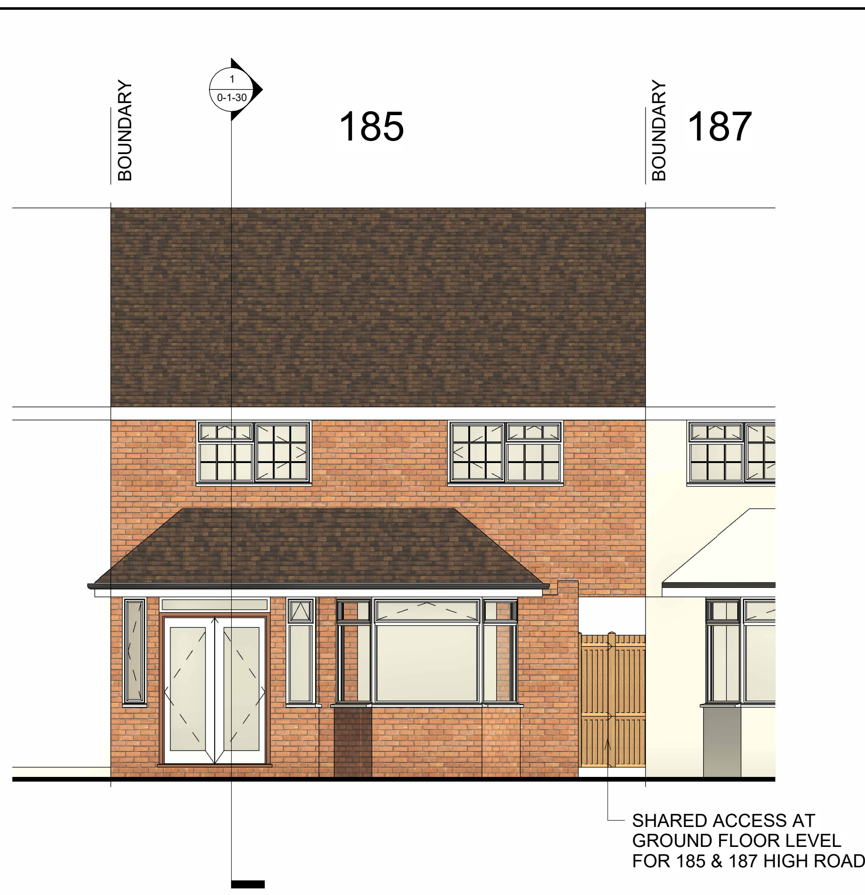
1 Front Elevation - Existing 1 : 50