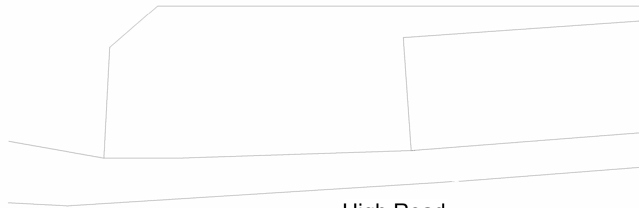
1 Block Plan - Existing 1 : 100