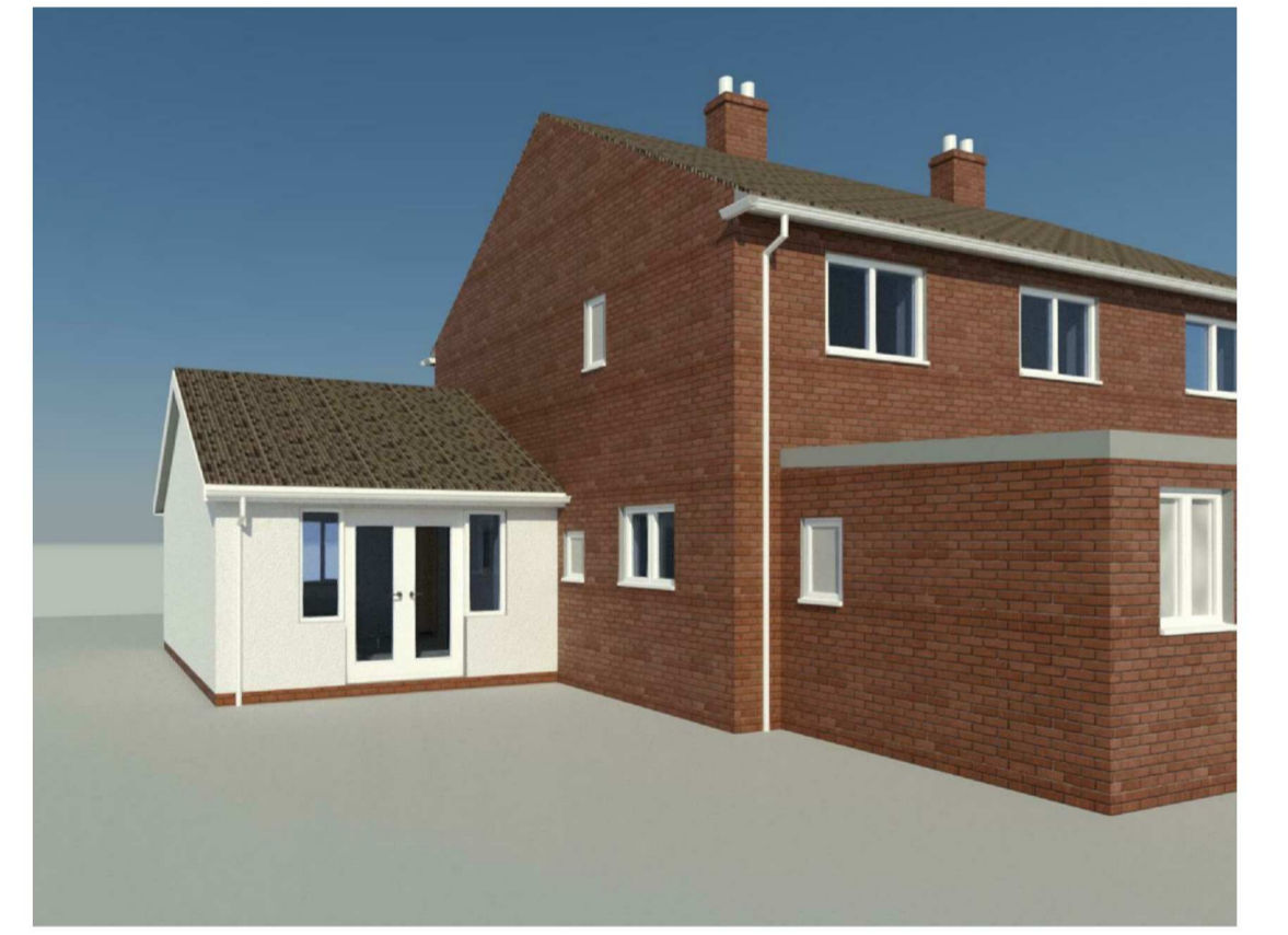
Proposed 3D view - Rear