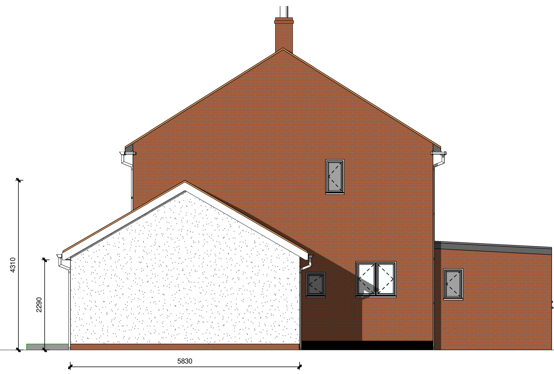
Proposed Side Elevation - North

No liability to the Employer arising out of any unauthorized modification or amendment to, or any transmission, copy or use of the material, or any proprietary work contained therein, by the Employer, Other Project Team Member, or any other third party. All dimensions are to be checked and verified on-site by the Main Contractor prior to commencement; any discrepancies are to be reported to the Contract Administrator. This drawing is to be read in conjunction with all other relevant drawings and specifications. Do Not Scale