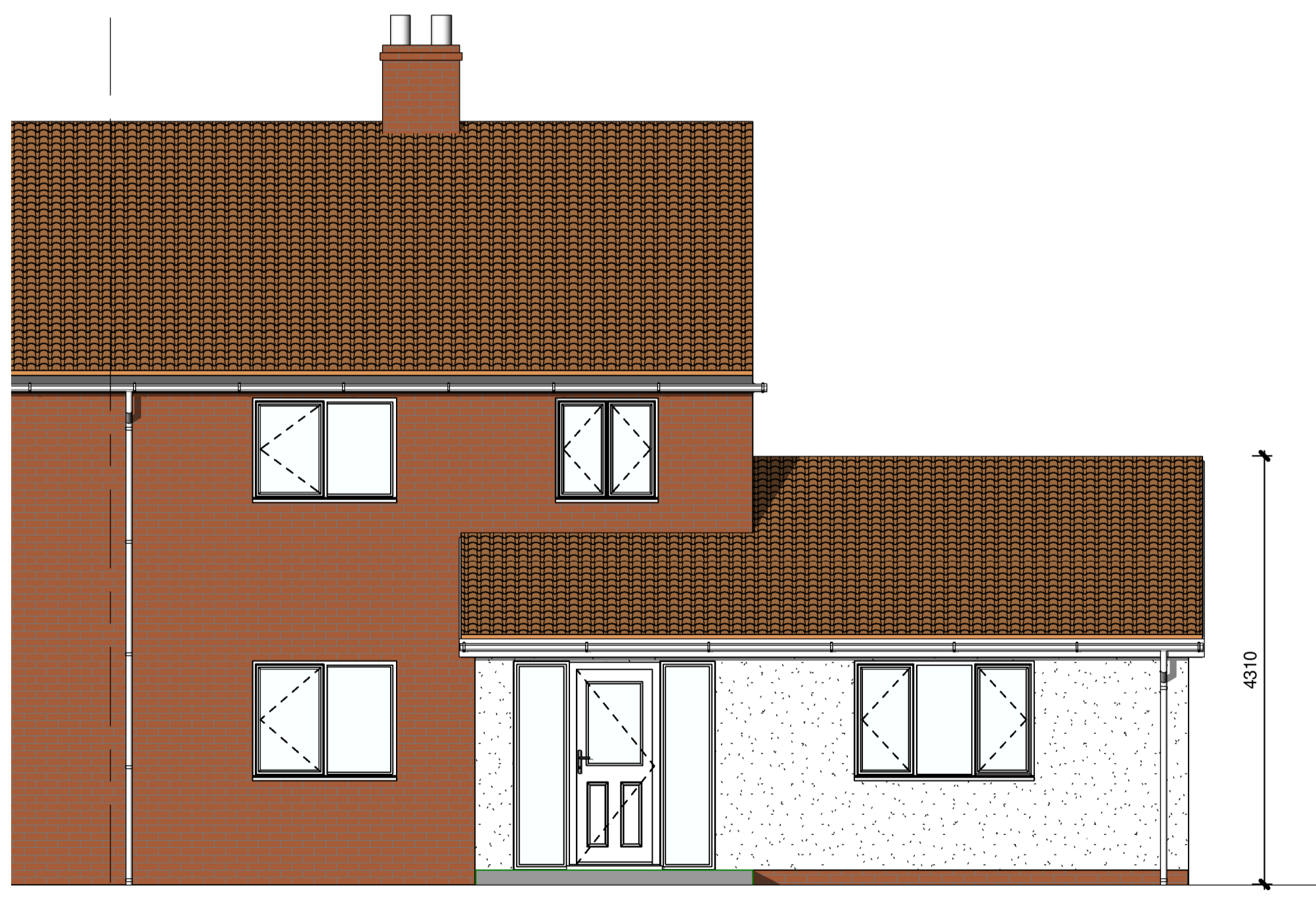
Proposed Front Elevation - East