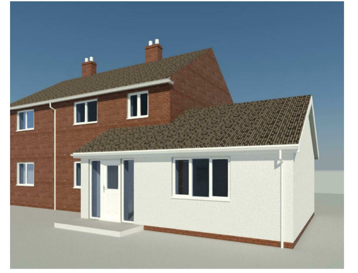
Proposed 3D view - Front