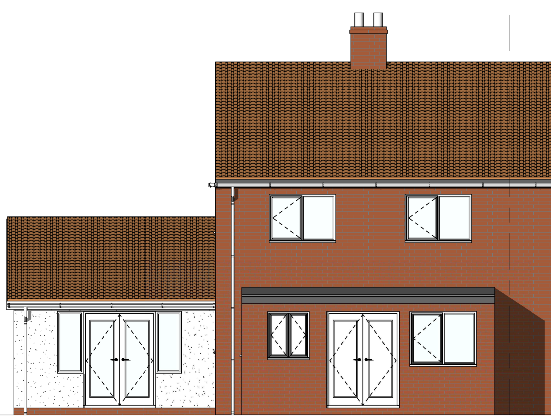
Proposed Rear Elevation - West