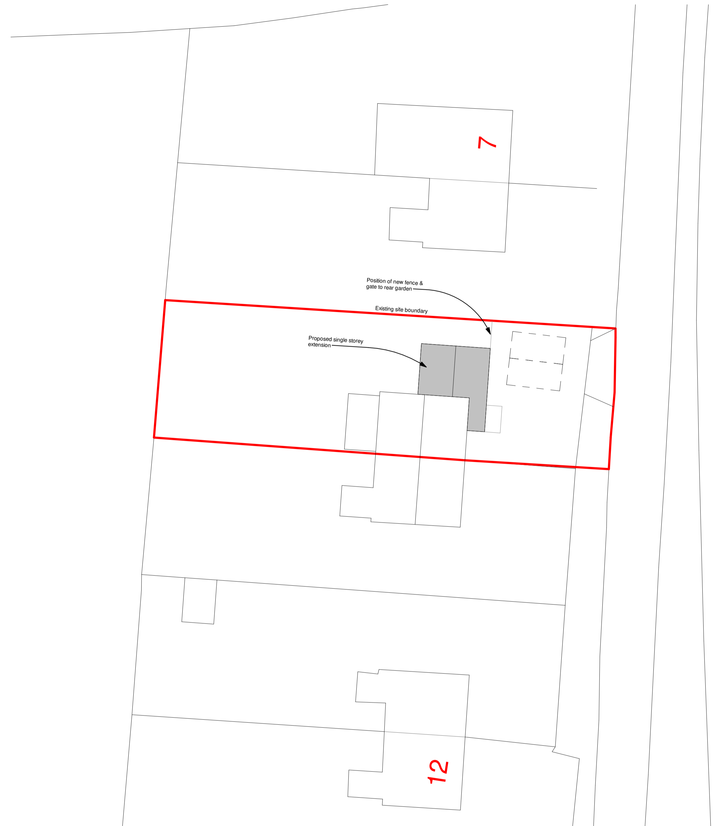
Proposed Block Plan @ 1:200