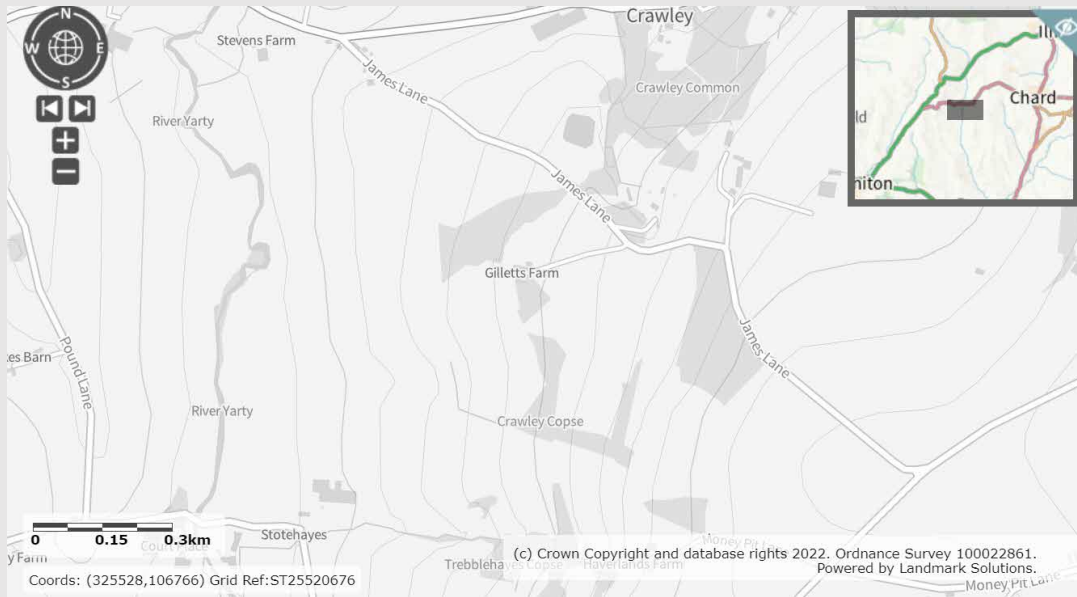
Figure 1: Location