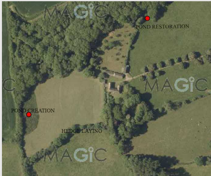
Figure 3: Pond creation profile