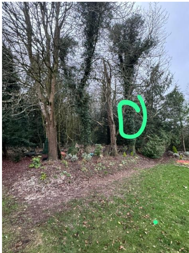
Proposed Location of Bat Box