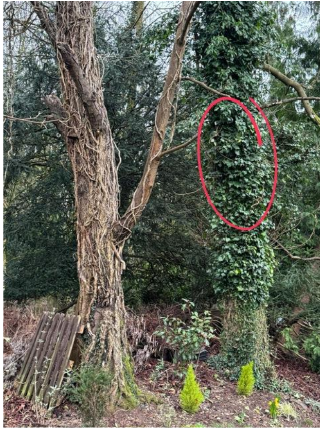
Proposed Location of Bat Box