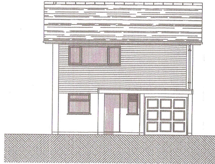
south elevation as existing 1:100