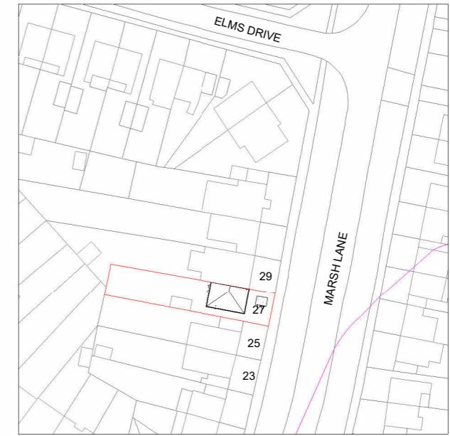
Site Location Plan Scale: 1:1250