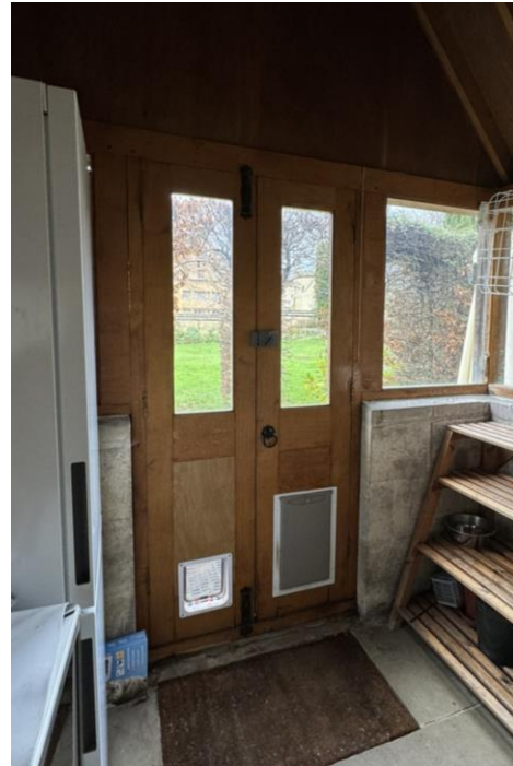
Porch doors viewed from internally.