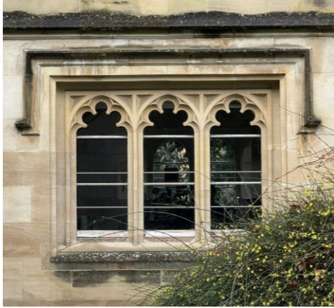
South East Window viewed Externally.