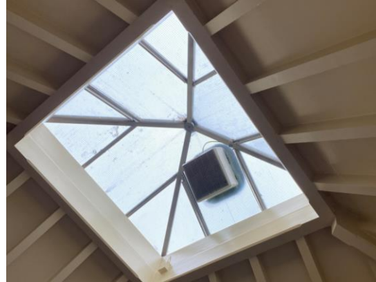
Existing Roof Lantern viewed internally and Externally