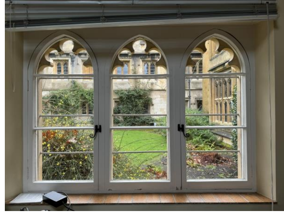
South East Window viewed Internally.