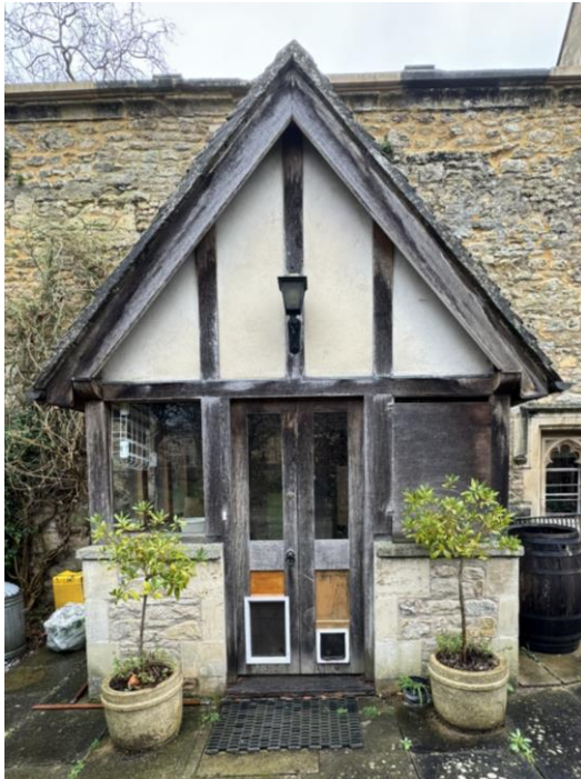
Porch Viewed from Externally.