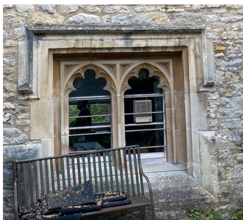
North East window viewed from Externally.