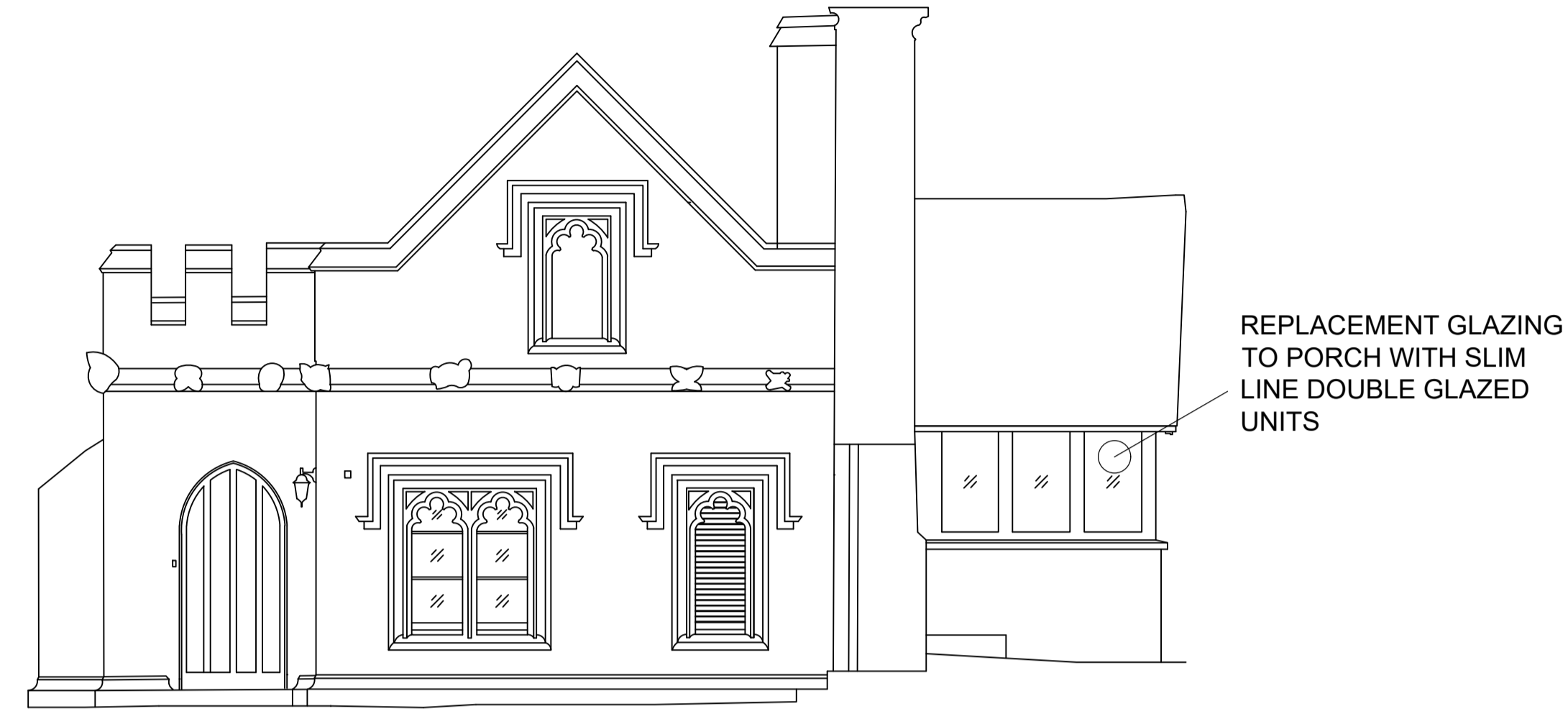
ELEVATION 2 - NORTH EAST SCALE 1:50 @ A1