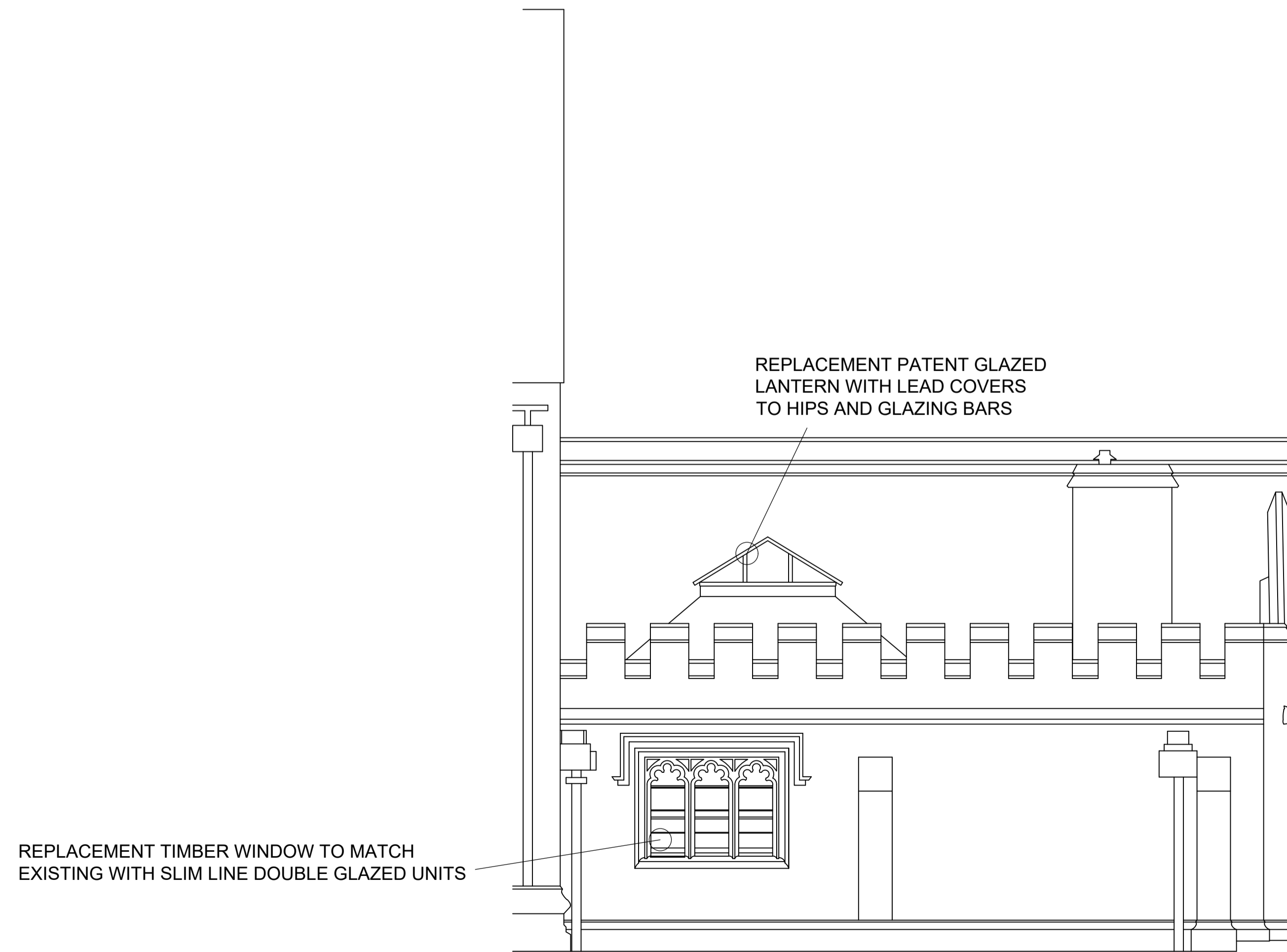
ELEVATION 3 - SOUTH EAST SCALE 1:50 @ A1