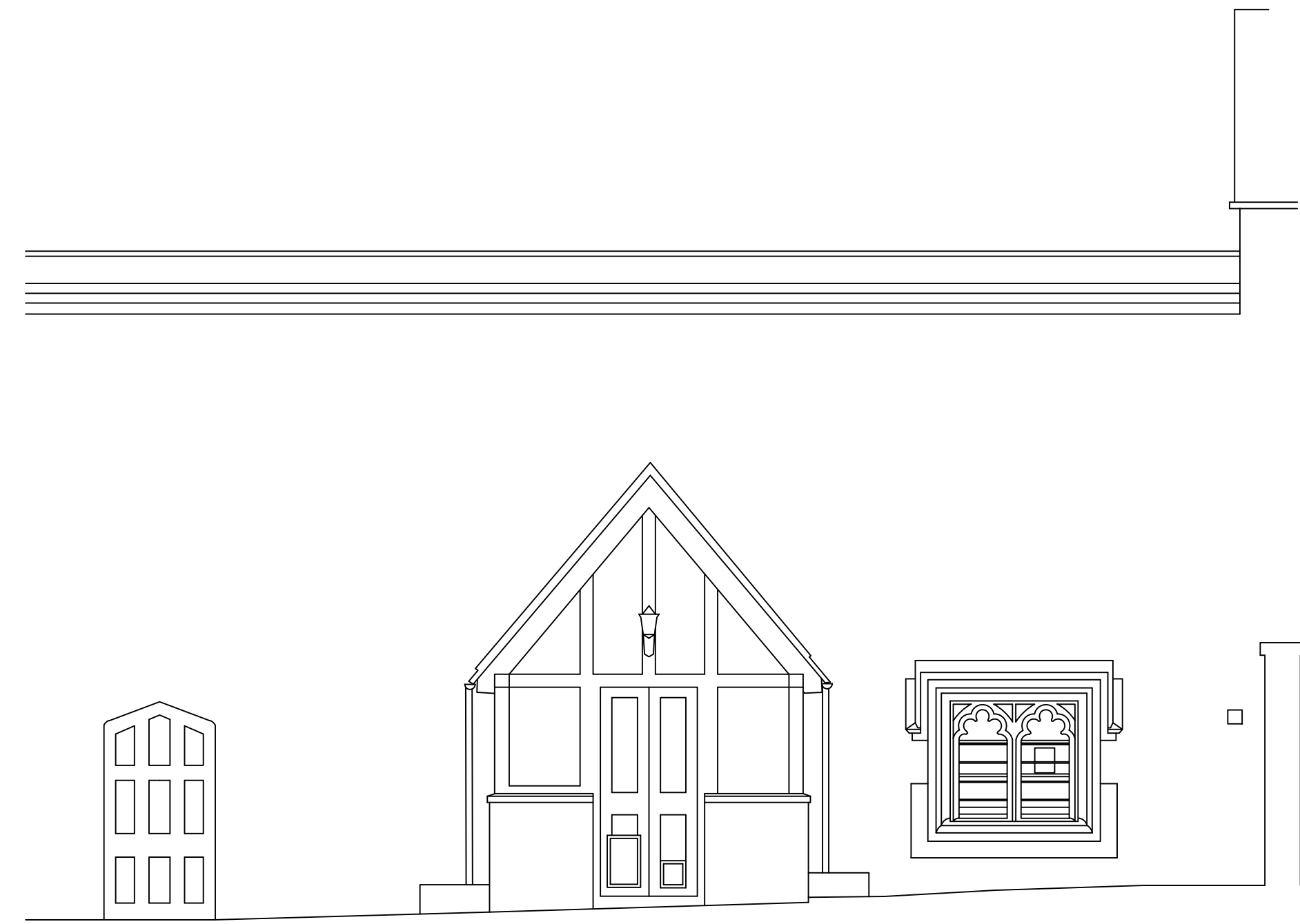
ELEVATION 1 - NORTH WEST SCALE 1:50 @ A1