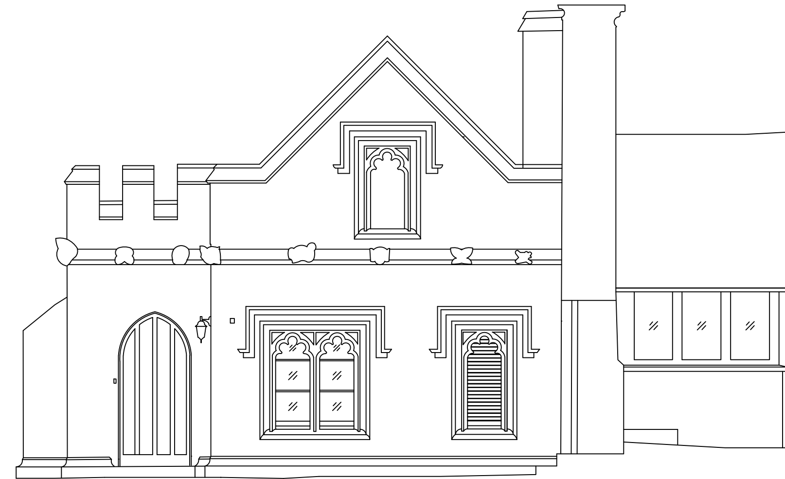
ELEVATION 2 - NORTH EAST SCALE 1:50 @ A1