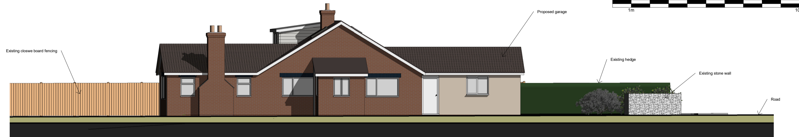
South East Elevation. 1 : 100