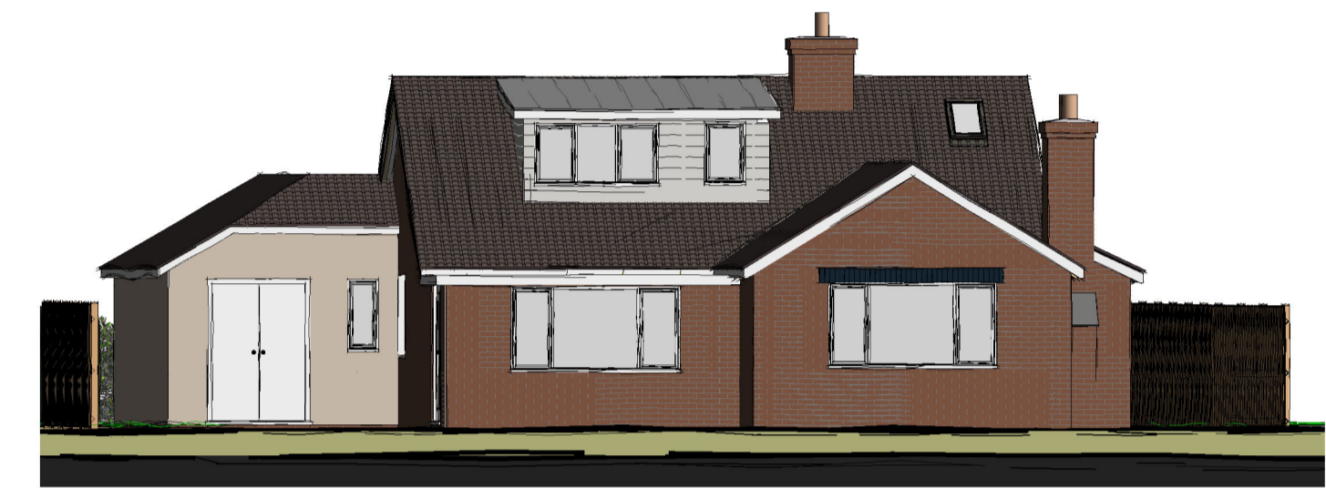
South West Elevation. 1 : 100