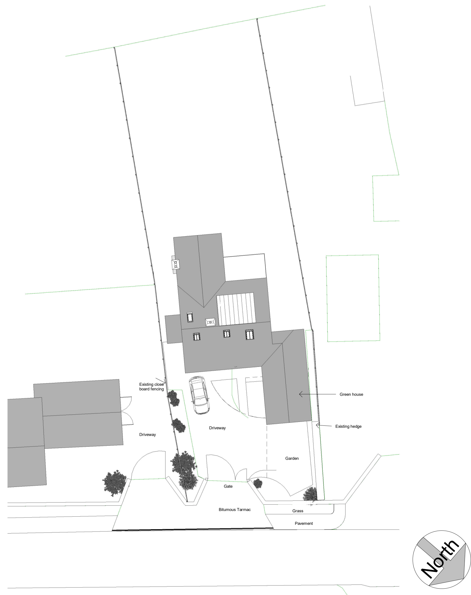
Site Plan. 1 : 200