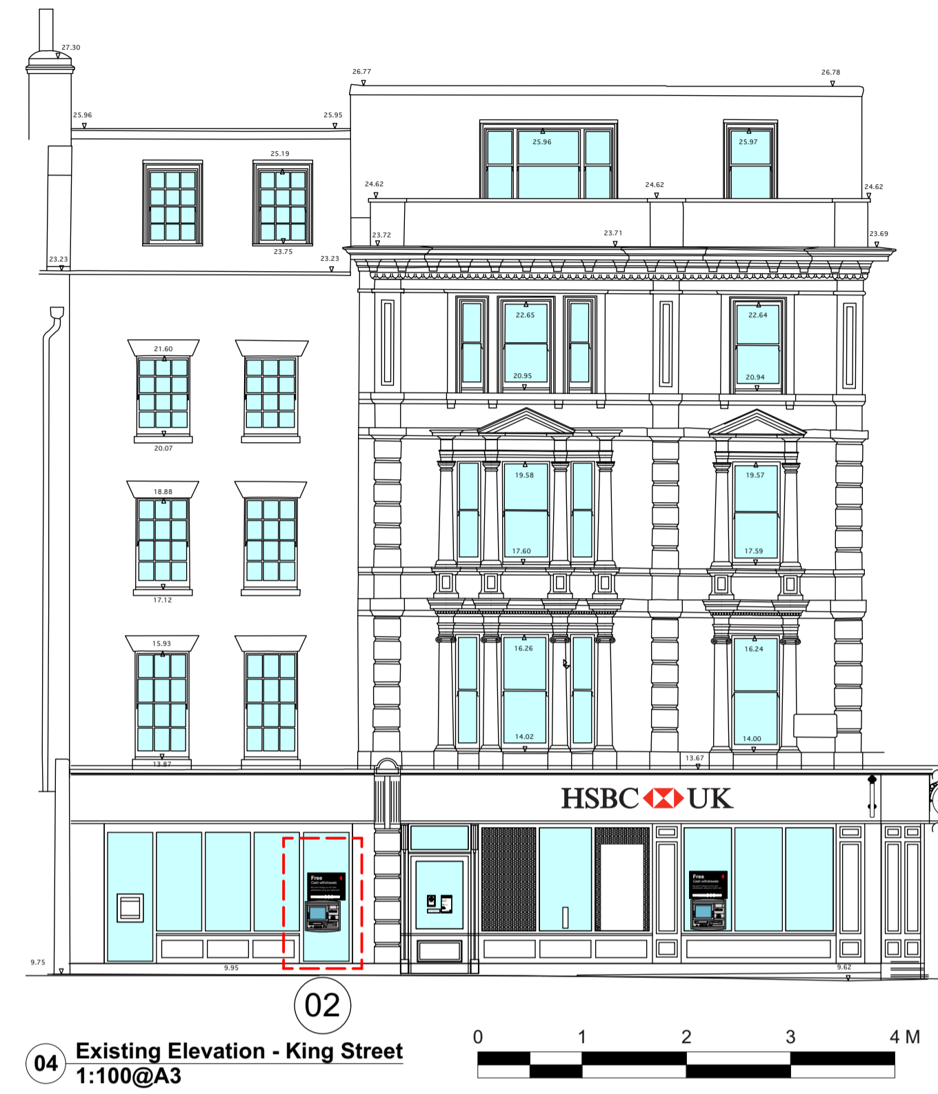
04 Existing Elevation - King Street 1:100@A3