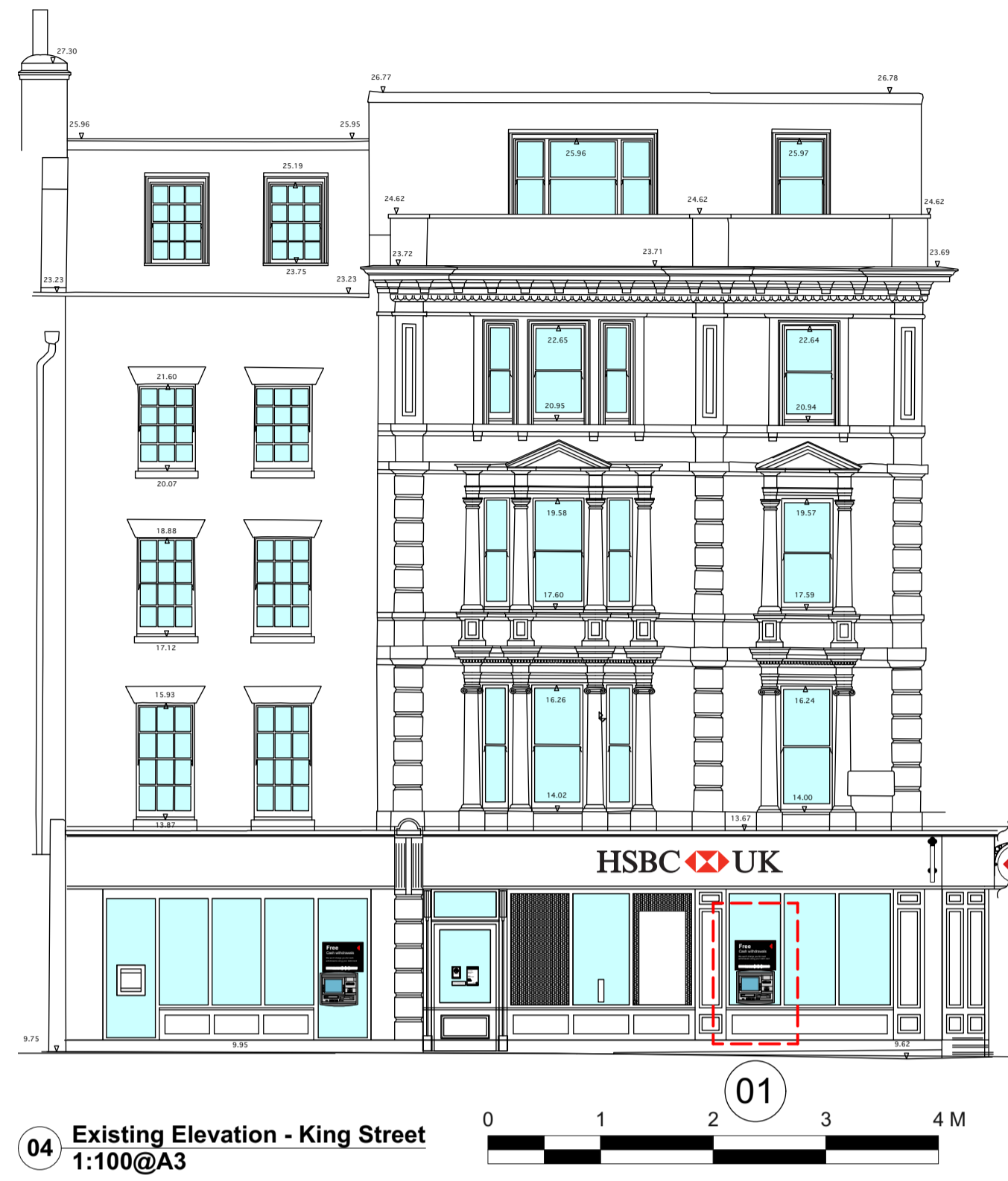
04 Existing Elevation - King Street 1:100@A3