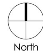
1 Location Plan 1:500