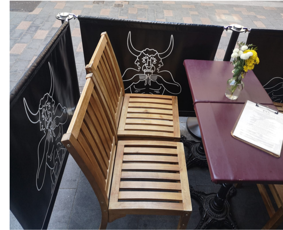
Seat Dimensions: H – 86cm, W – 46cm, D – 56cm