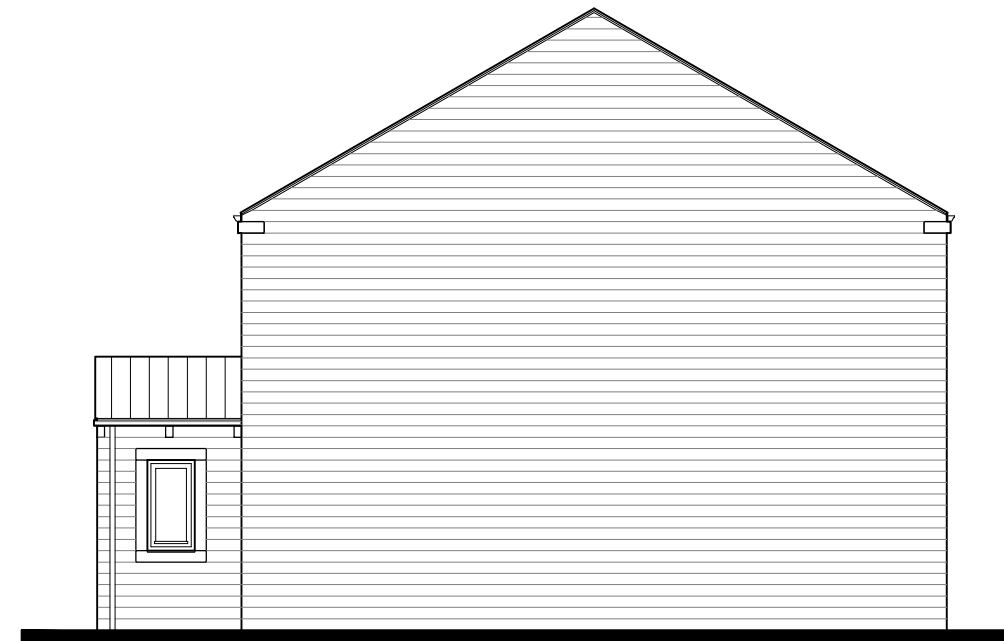
R.H. SIDE ELEVATION