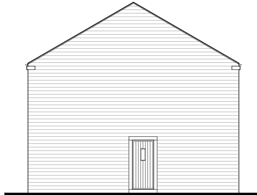
L.H. SIDE ELEVATION

PLOT 1 ELEVATIONS - 2316-P1-02 BRETON MILL FARM SCALE:1:100@A3