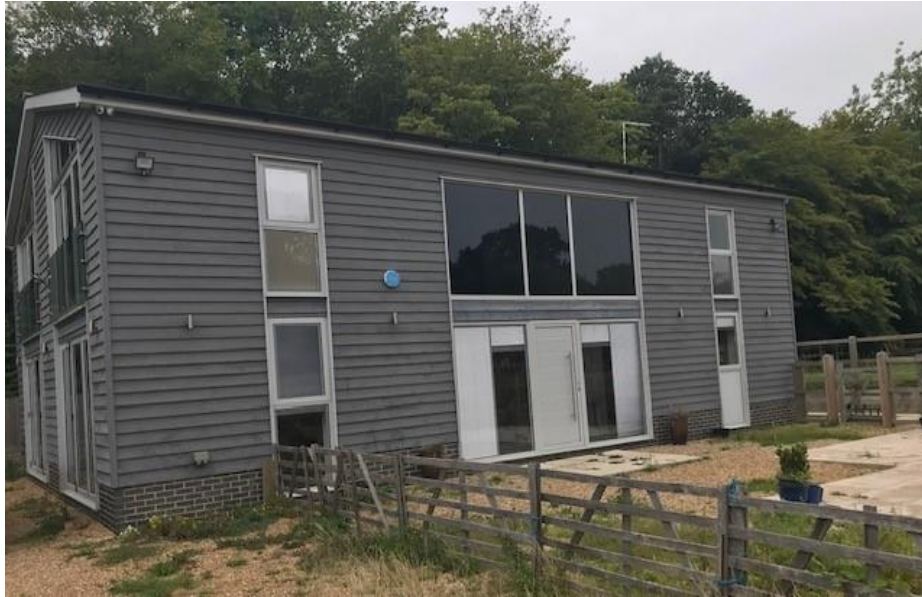
Figure 3: Image of dwelling

The detached dwelling is finished in timber weatherboarding with a brick plinth below finished in grey coloured facing bricks. The Applicant has recently been advised that the cladding material is not longer supported by their mortgage lender and as such the dwelling is un-mortgageable. This has prompted this application.