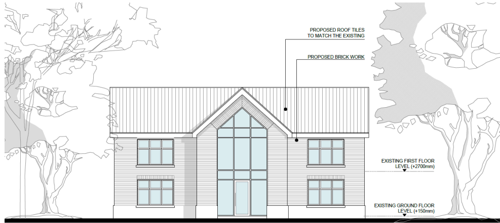
Figure 4: Proposed Front Elevation

In addition to replacement of the timber cladding, this application seeks planning permission for the raising of the ridge and eaves of the to improve the proportions of the front elevation and accommodate a steeper pitch to the roof and the addition of a two storey front gable feature.