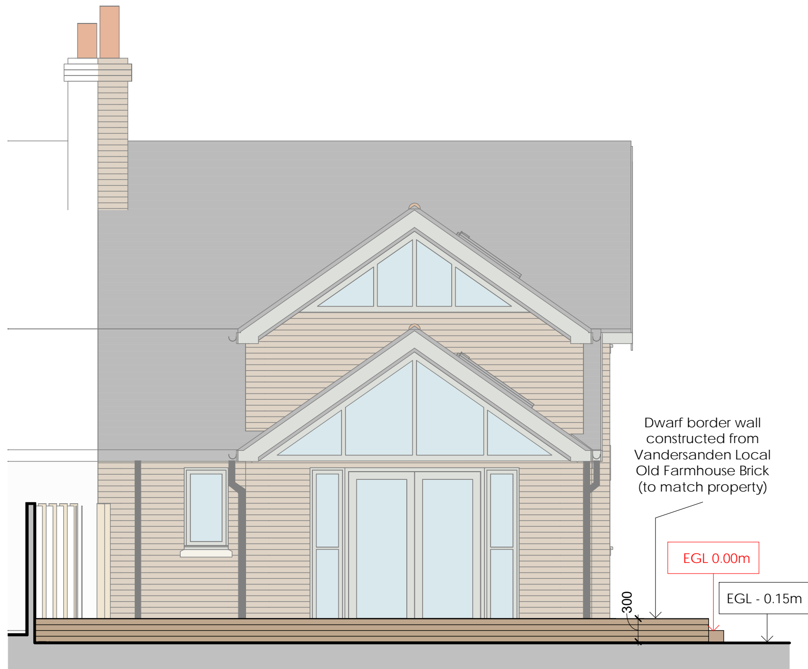
Patio West Elevation