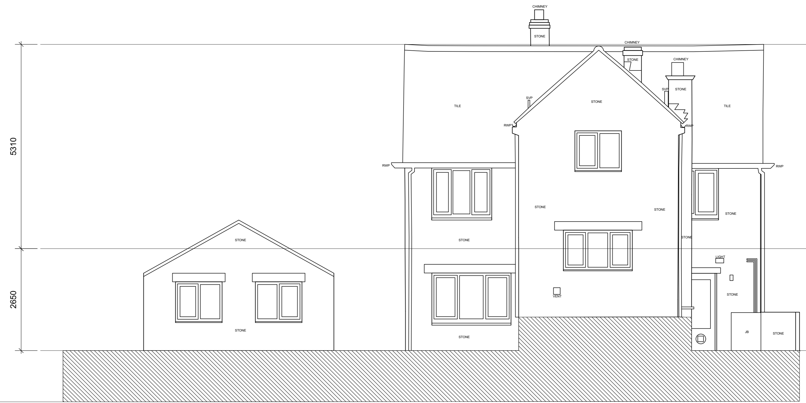
1 EXISTING REAR ELEVATION Scale: 1:50