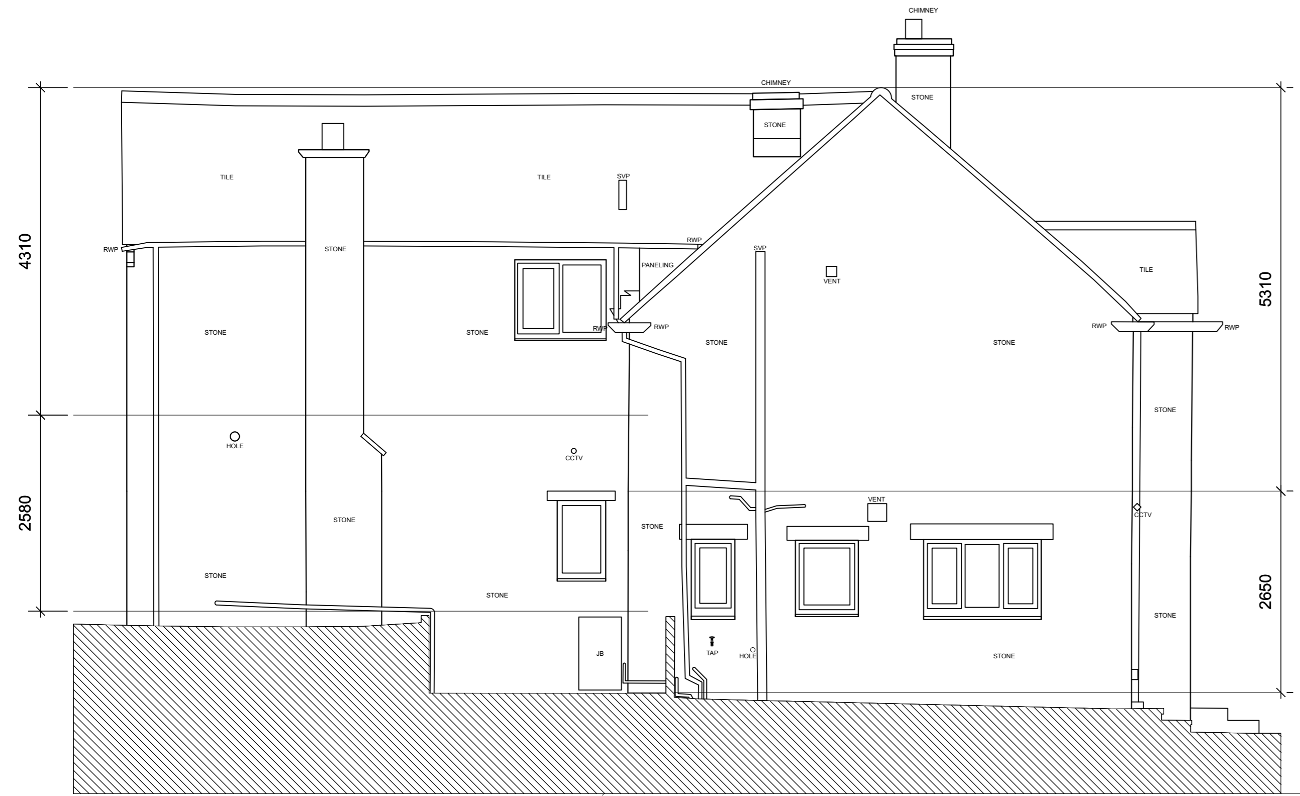
1 EXISTING SIDE ELEVATION Scale: 1:50