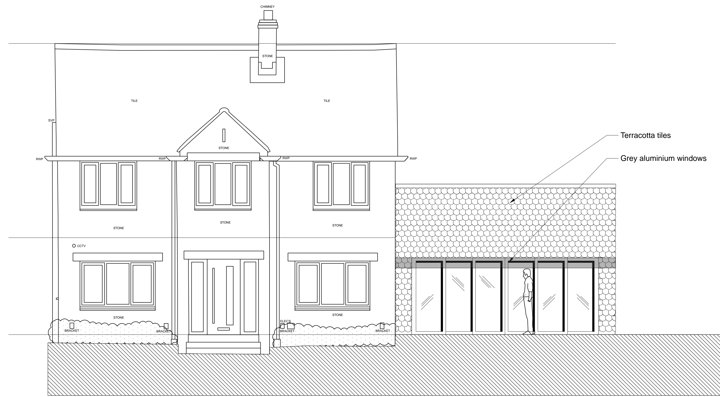
1 EXISTING FRONT ELEVATION Scale: 1:50