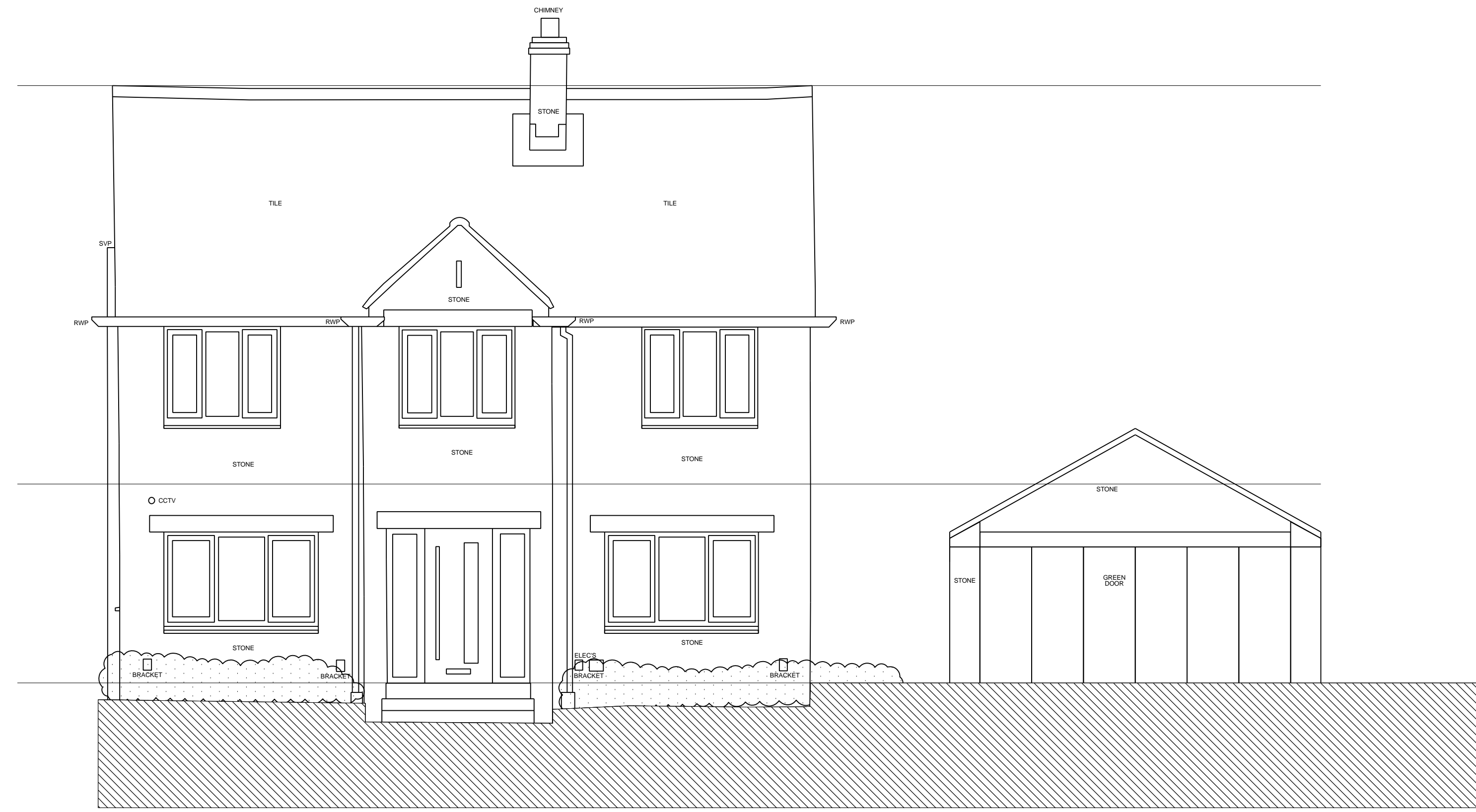
1 EXISTING FRONT ELEVATION Scale: 1:50