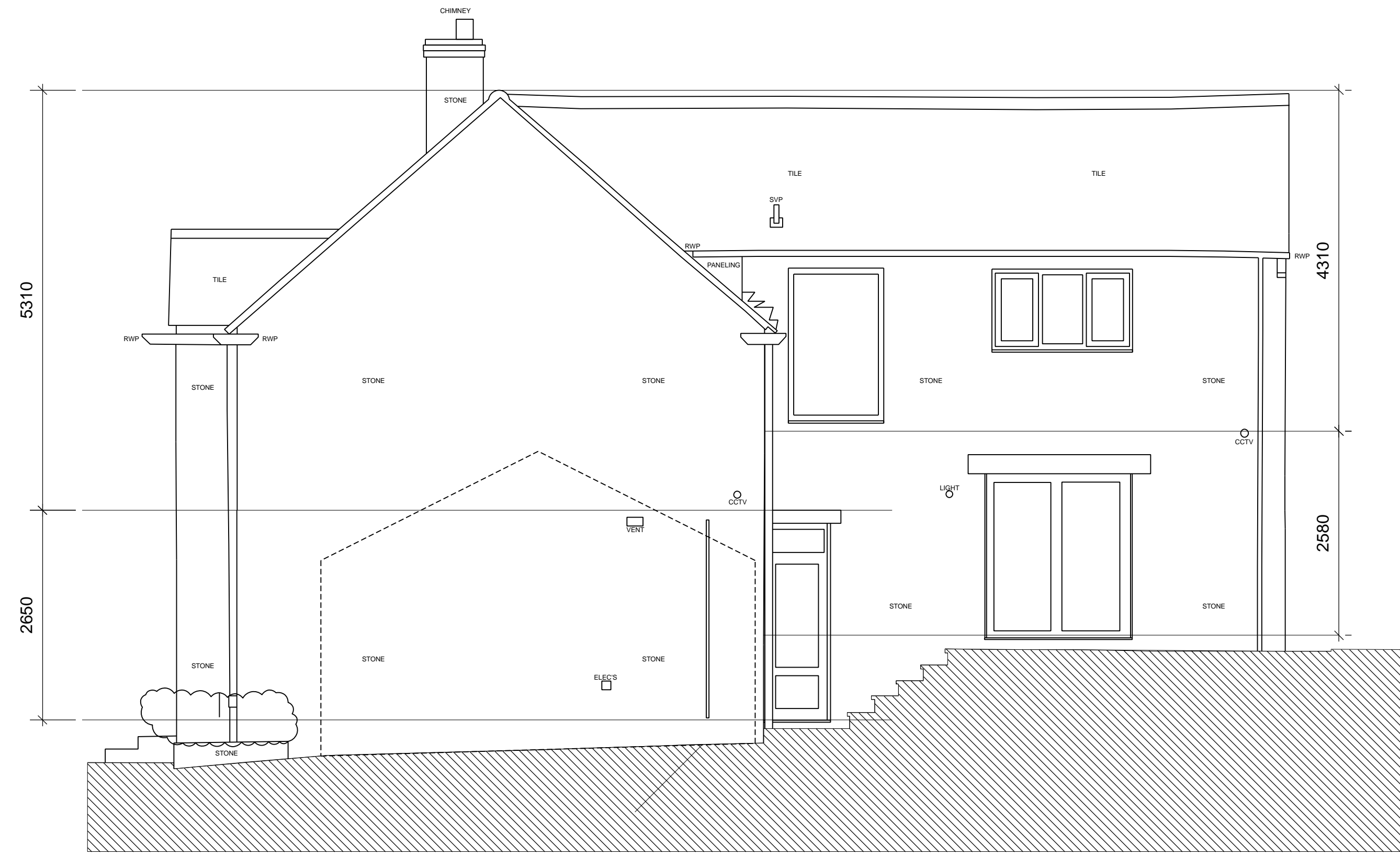
1 EXISTING SIDE ELEVATION Scale: 1:50