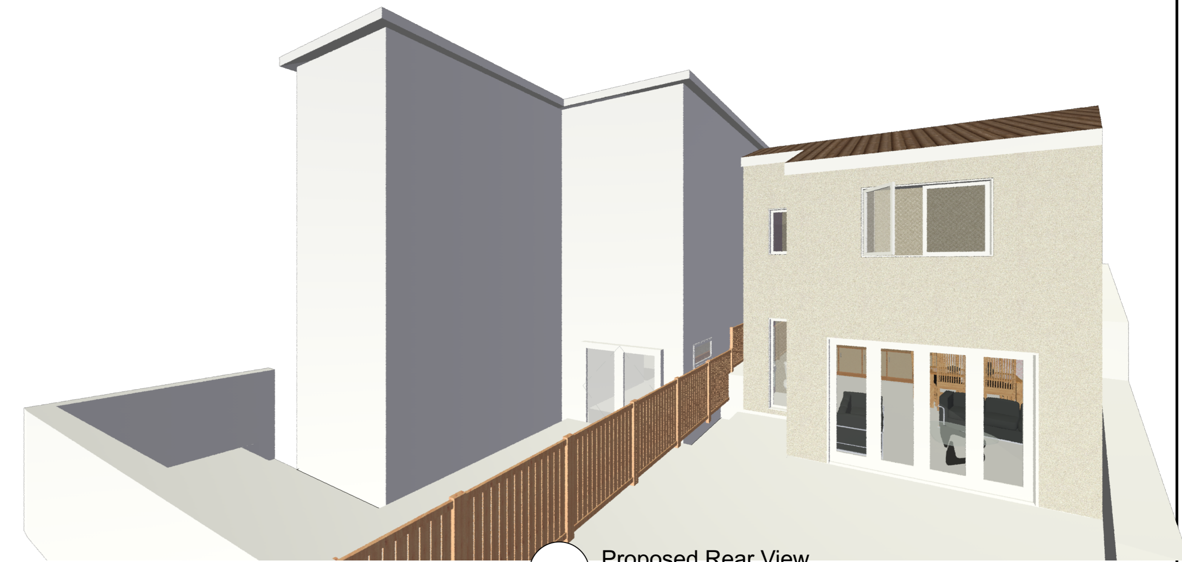
1 Proposed Rear View Scale: 1:100