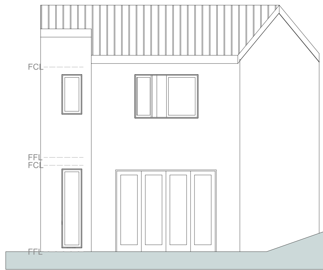
103 Proposed Rear Elevation Scale: 1:50