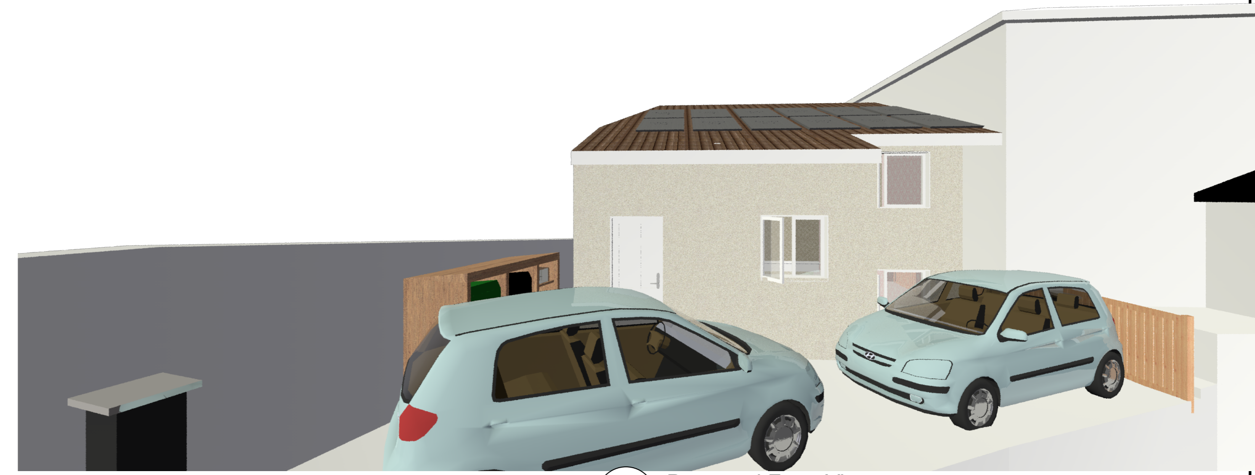
106 Proposed Front View Scale: 1:100