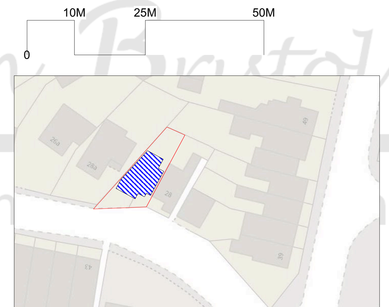
2 OS Extract Scale: 1:500