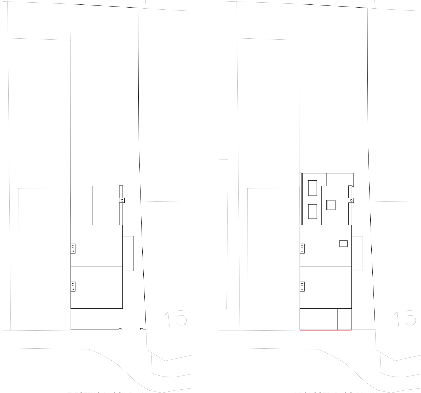
EXISTING BLOCK PLAN (1:200)