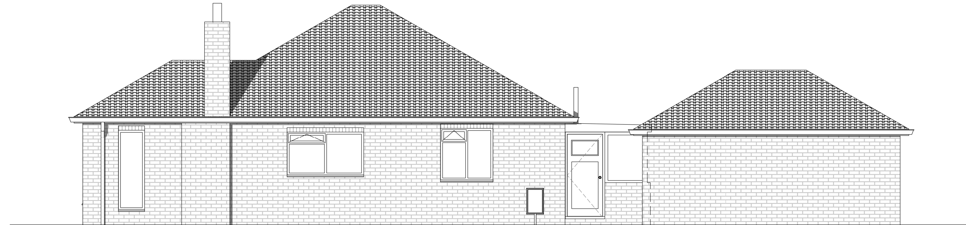
3 Right Elevation 1 : 50