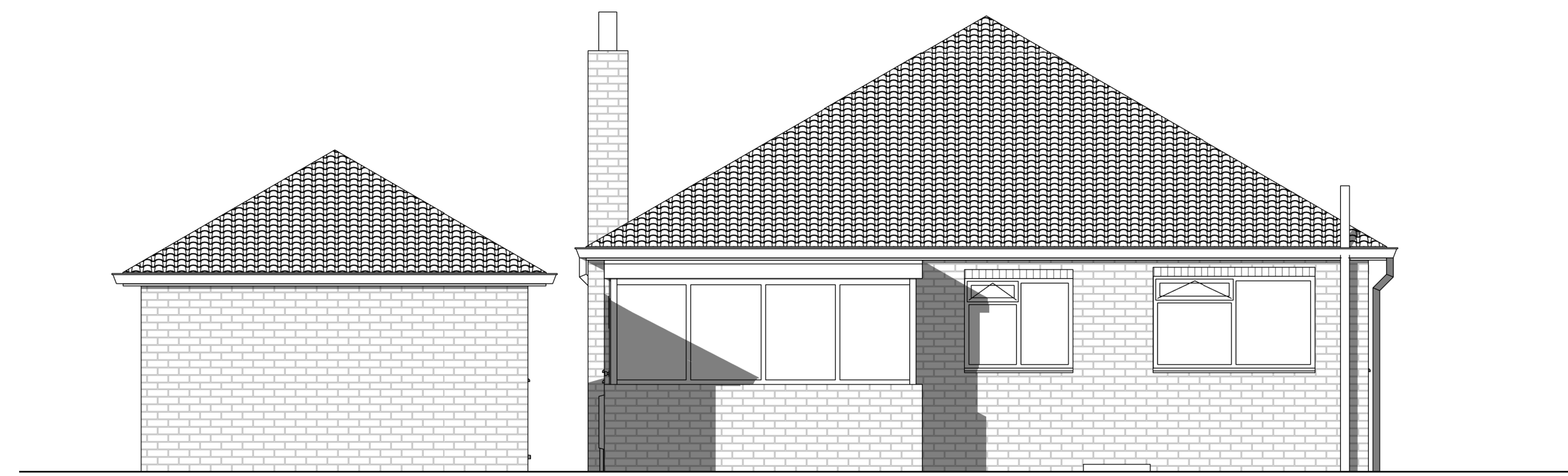
2 Rear Elevation 1 : 50