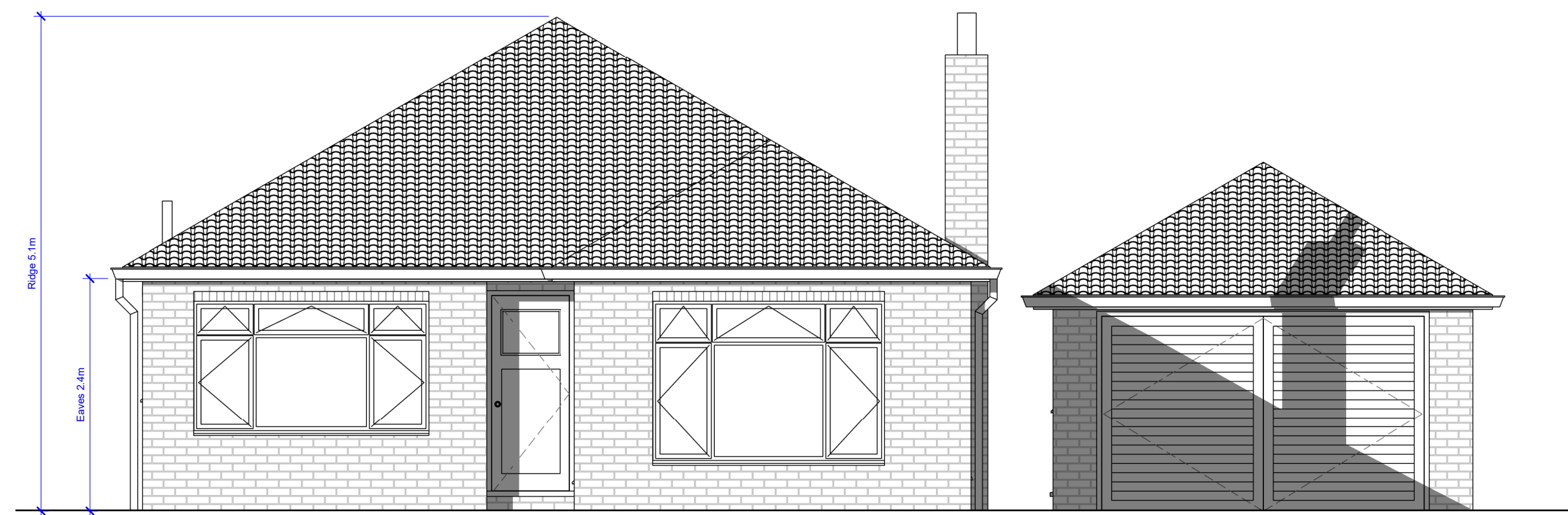
1 Front Elevation 1 : 50