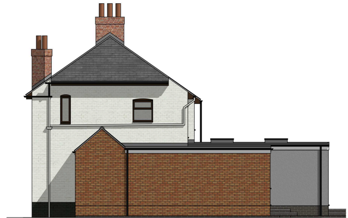
PROPOSED SOUTH ELEVATION 1:100