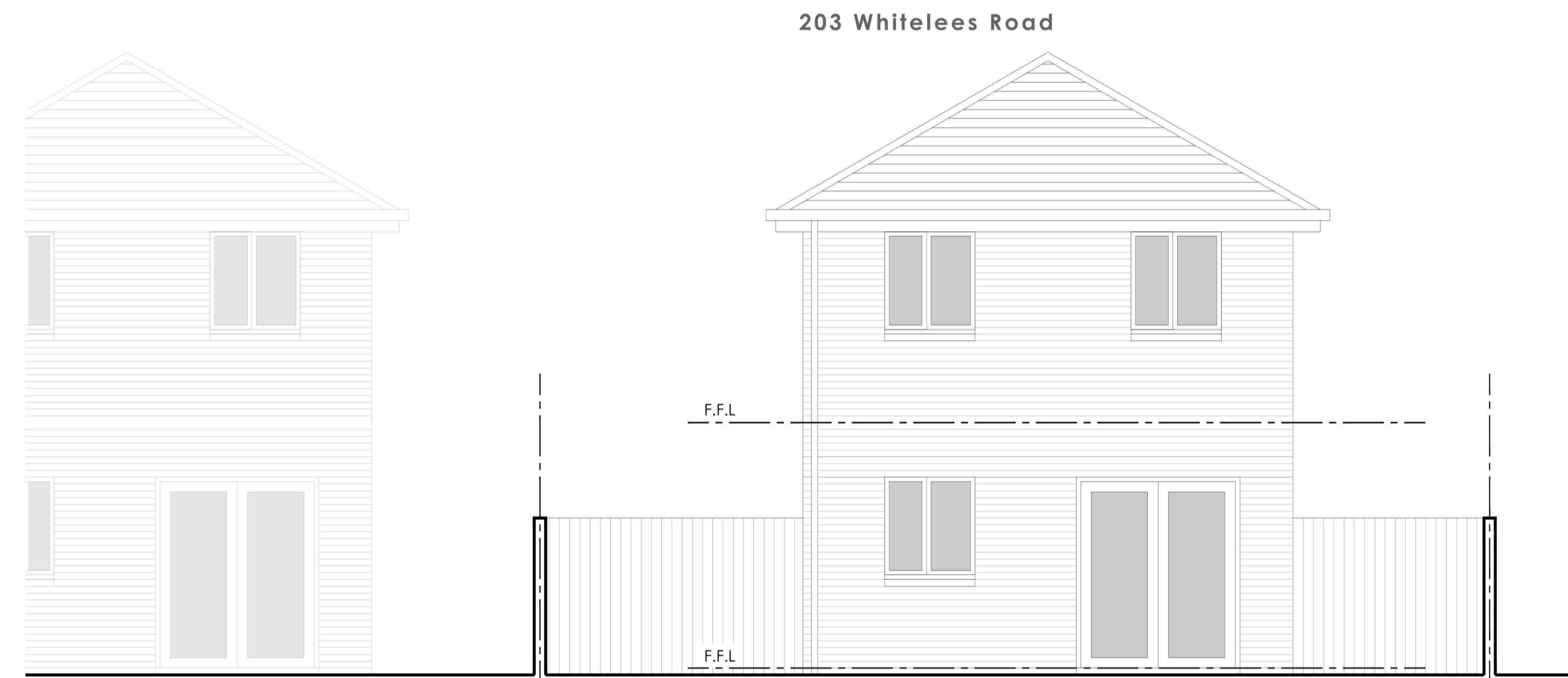
EXISTING EAST (GARDEN) ELEVATION 1:50