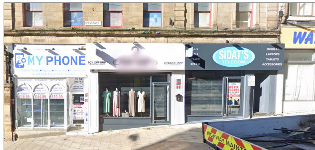
SHOP FRONT AS INSTALLED 2022