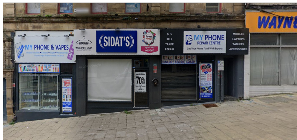
SHOP FRONT AS INSTALLED 2023