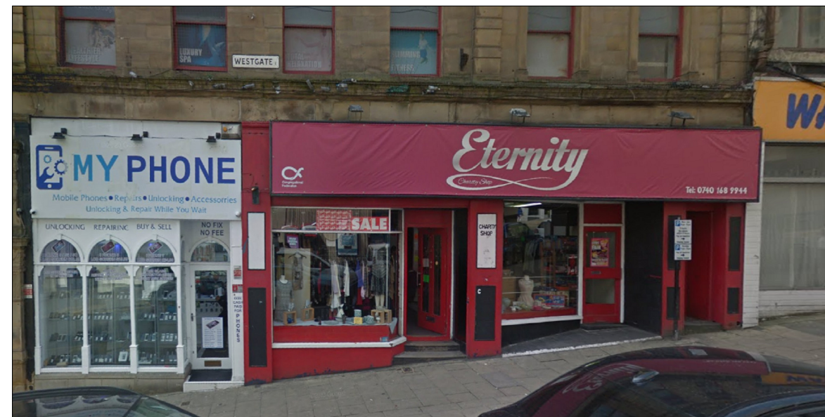
SHOP FRONTS 2019