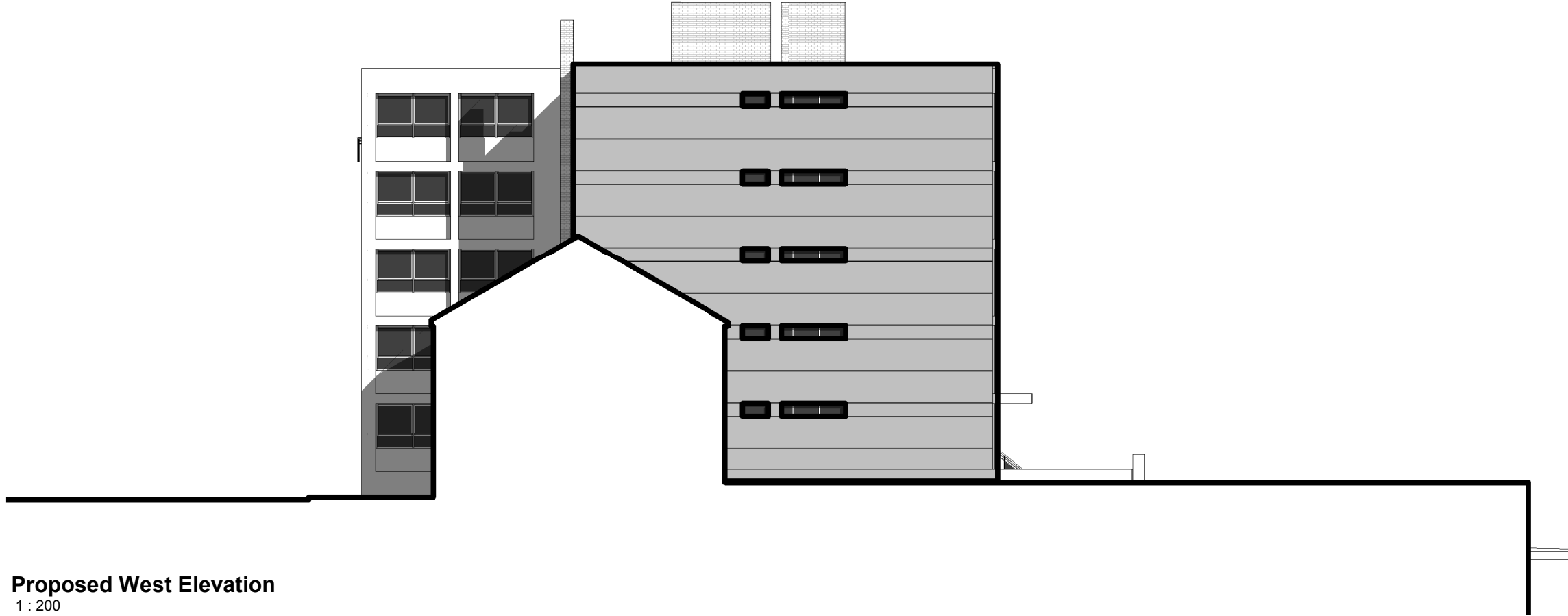
Proposed West Elevation 1 : 200