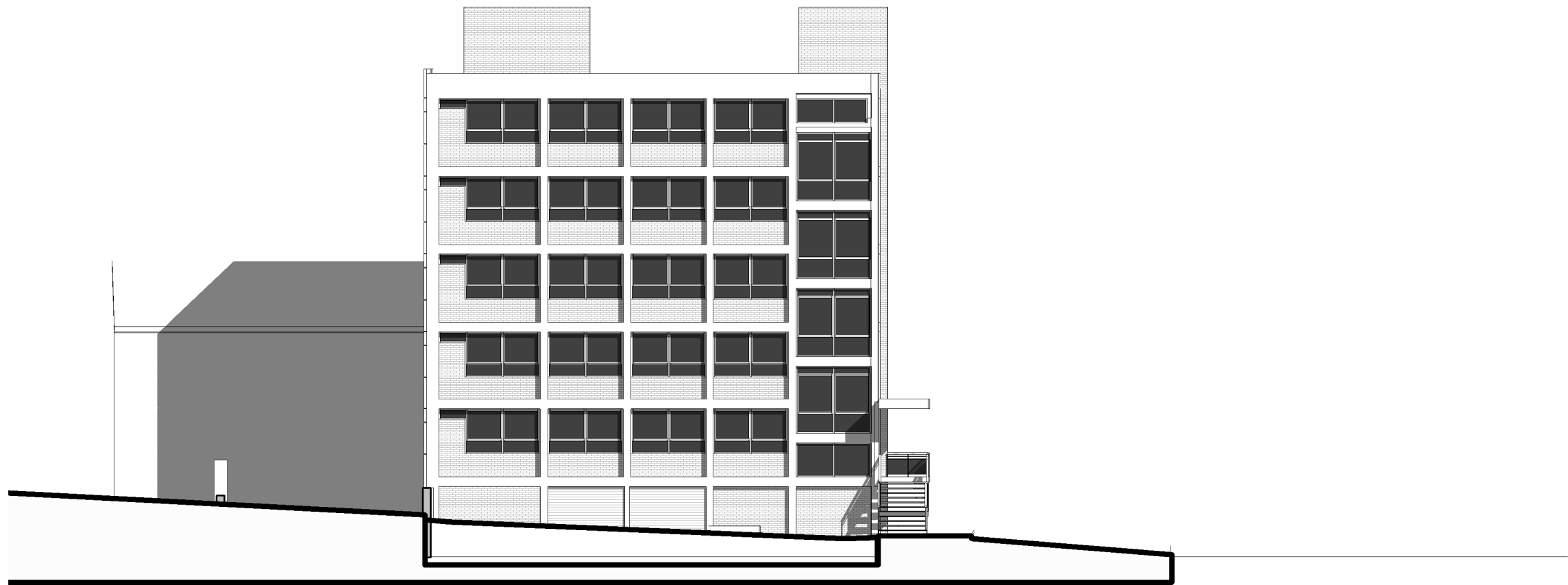
Proposed South Elevation 1 : 200