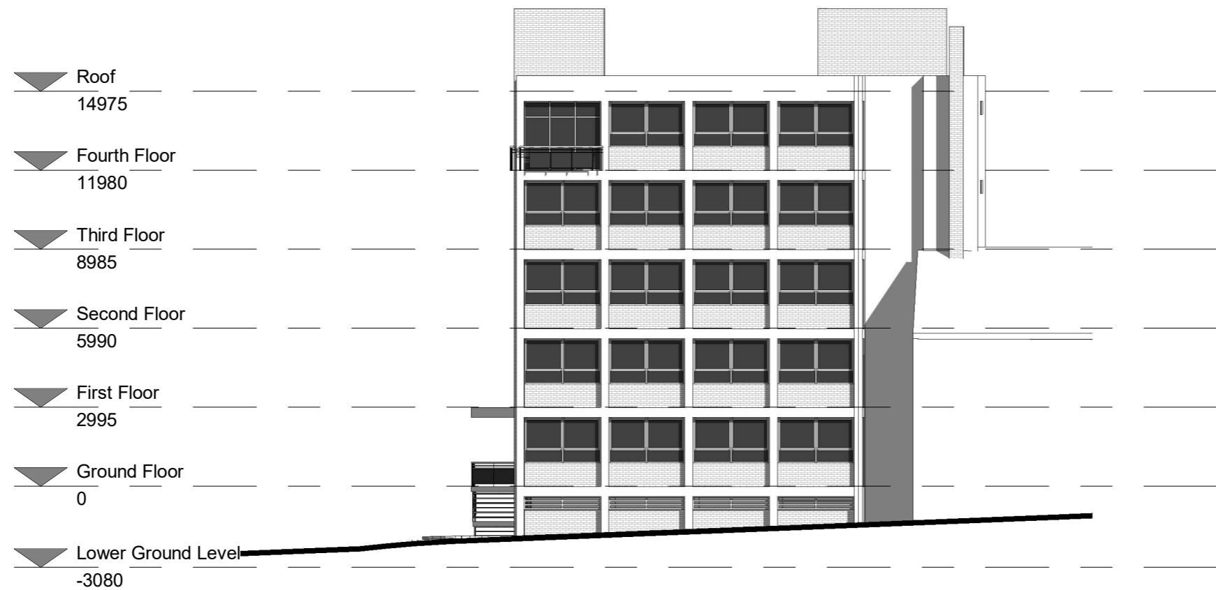
Existing North Elevation 1 : 200