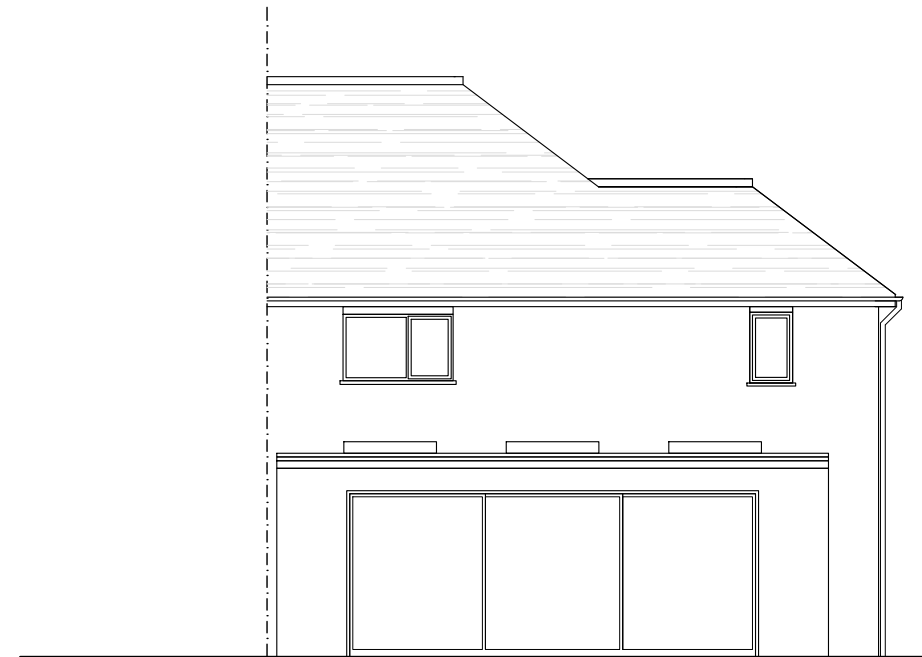
EXISTING REAR (NORTH-EAST) ELEVATION