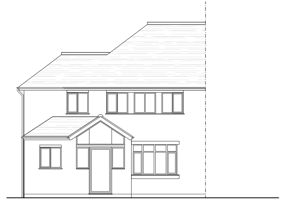
EXISTING FRONT (SOUTH-WEST) ELEVATION