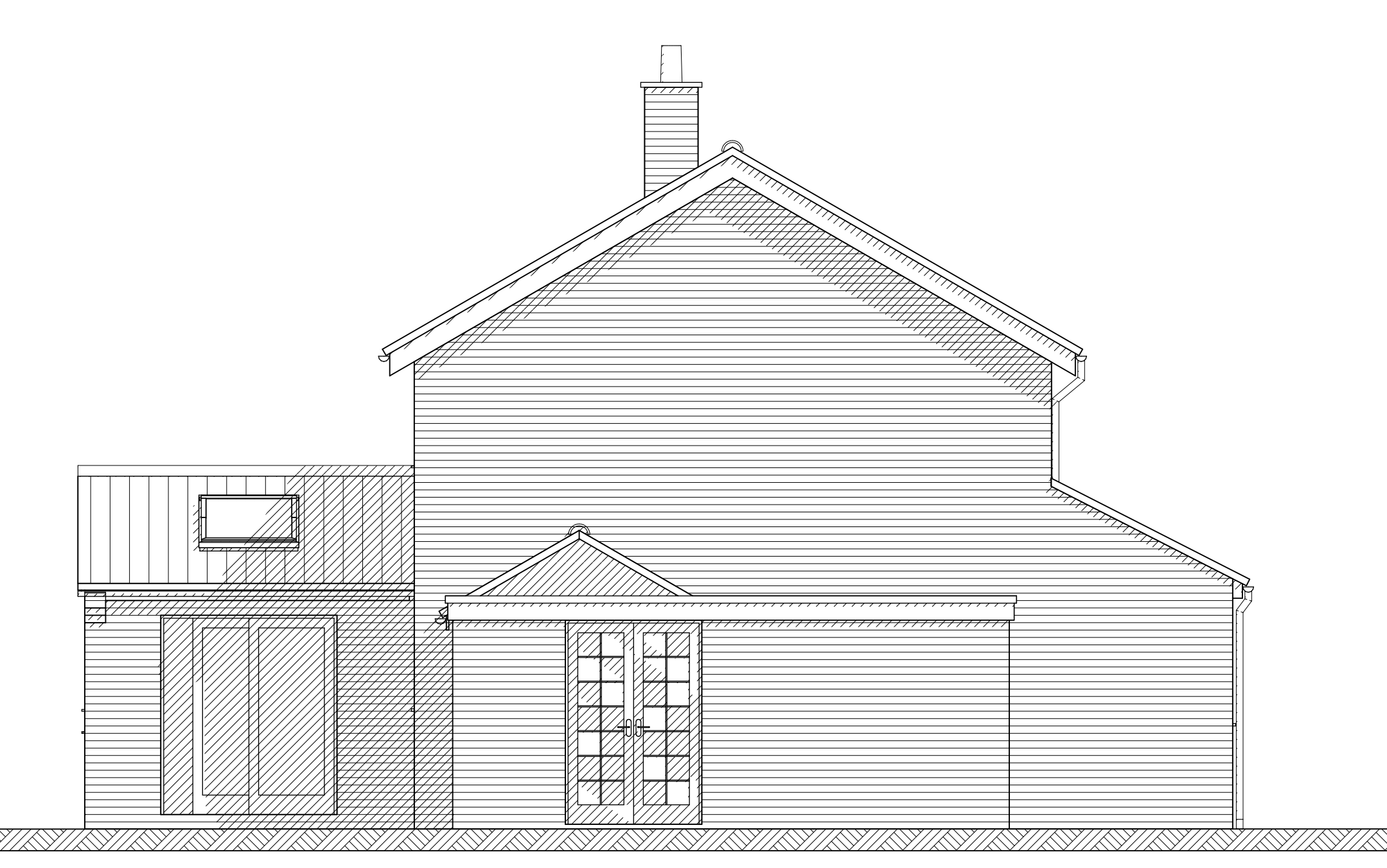
West elevation existing