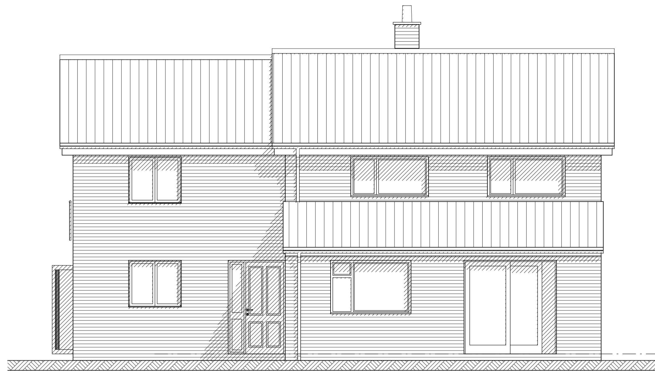
South elevation proposed