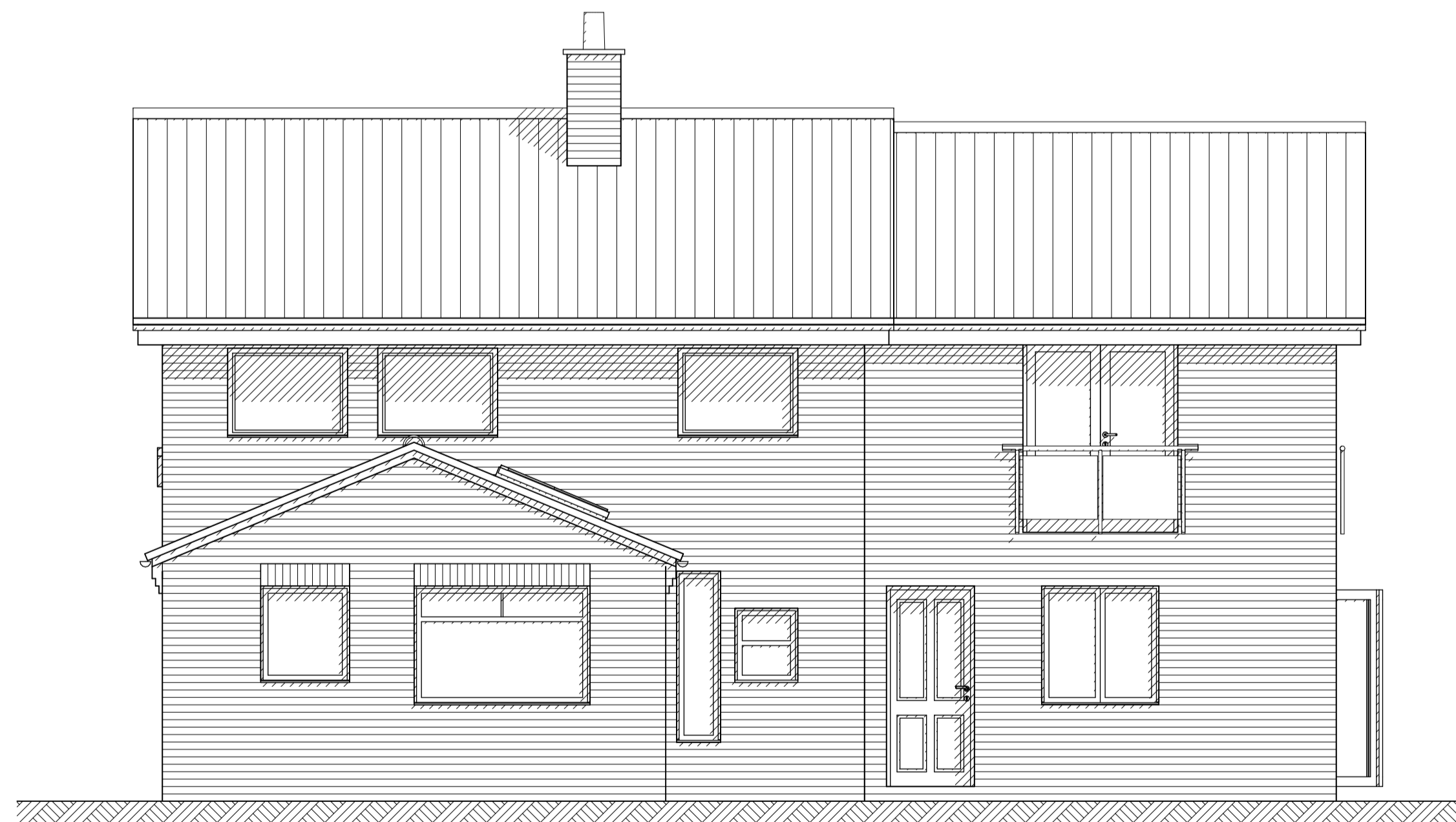
North elevation proposed